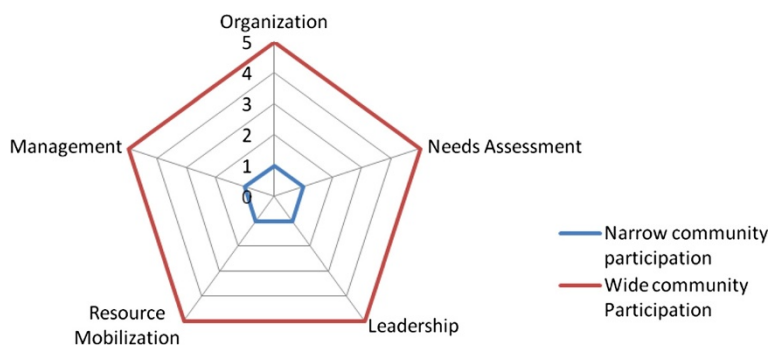
Figure 1 Spider-gram for measuring community participation [15].

To develop a holistic understanding of community participation in Nachanta CHPS, we examined the