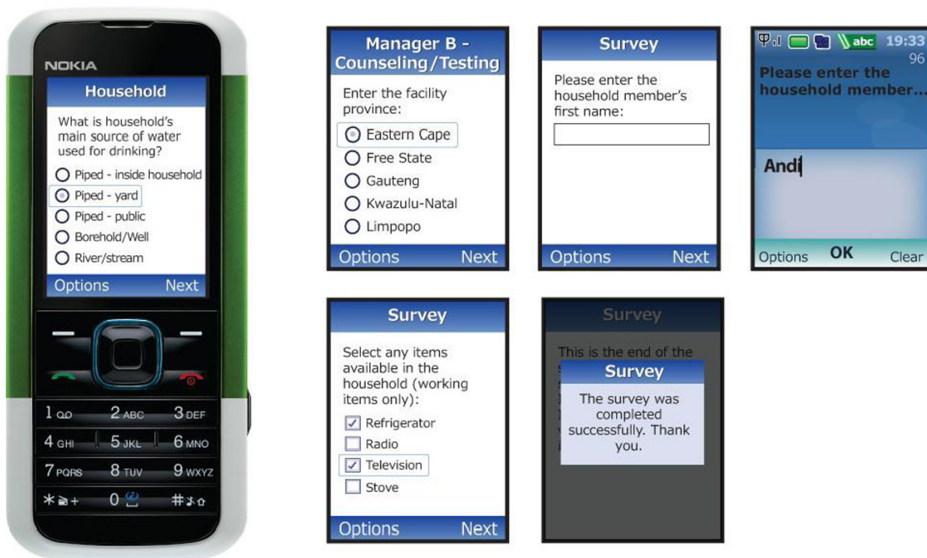
Figure 1 Screen shots of survey on the mobile phone.

All survey data were encrypted, thus maintaining the confidentiality of responses. Communication between the browser and the server was encrypted using 128-bit SSL. System servers were secured by firewalls to prevent unauthorised access and denial of service attacks, while data was protected from virus threats using NOD32 anti-virus technology. Access to the web-interface is protected by passwords. In the current study, access to the data was restricted to the principal investigator, the project manager, data quality officer and web administrator.