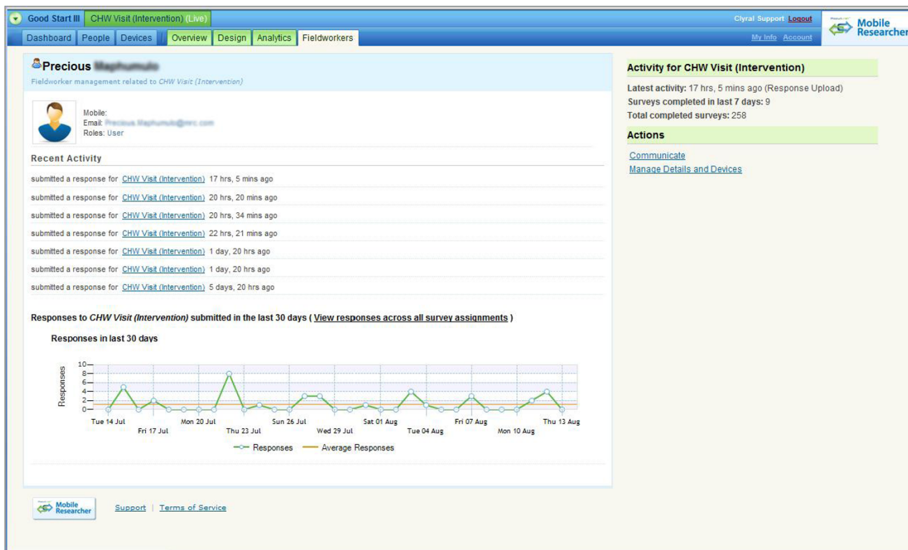
Figure 4 Community health worker output.

guarantee that data loss cannot occur with this system, we believe the chances of data loss were significantly minimized.