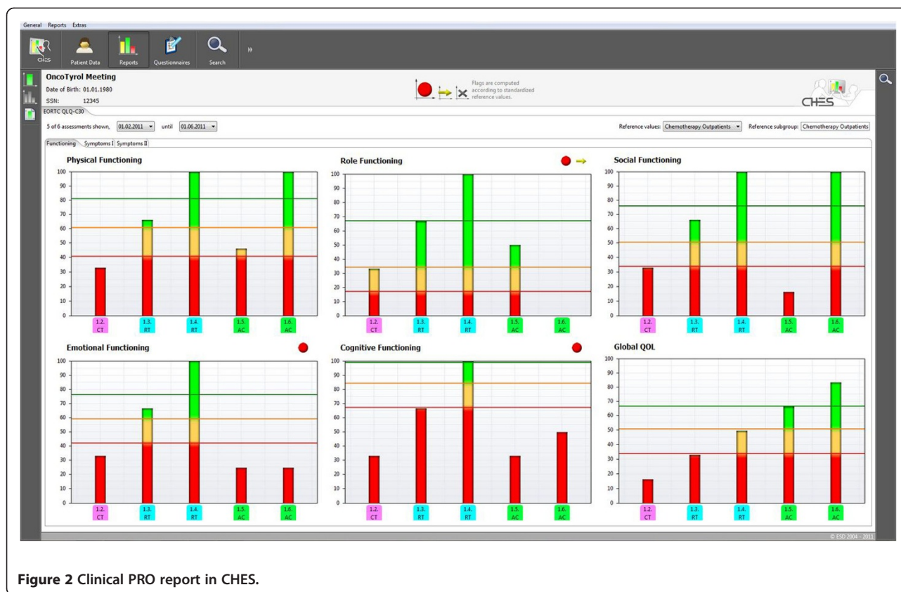
Figure 2 Clinical PRO report in CHES.