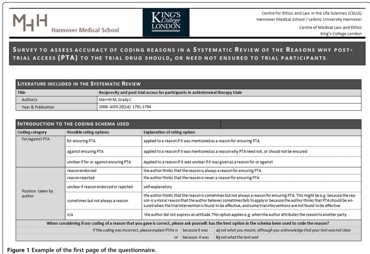
Figure 1 Example of the first page of the questionnaire.

According to German regulation (Pharmaceutical and Medical Devices Laws, Medical Professional Law), no ethics approval is necessary for socio-empirical research that does not involve patients. Our study surveyed authors of bioethics papers. The handling of data safety