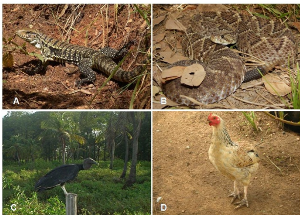
Figure 2 Examples of animals used as medicine that are sold in public markets in Crato and Juazeiro do Norte. A: Tupinambis merianae , B: Crotalus durissus, Gallus domesticus, D: Coragyps atratus.

The species most frequently cited in the present study were: Tupinambis merianae (n = 20) and P. tuberosus and Crotalus durissus (n = 18) (Figure 2). These species are similarly widely used in alternative medicinal practices in other regions of Brazil [16-18,22,41]. Most of the animal species cited are only found wild in nature; only five