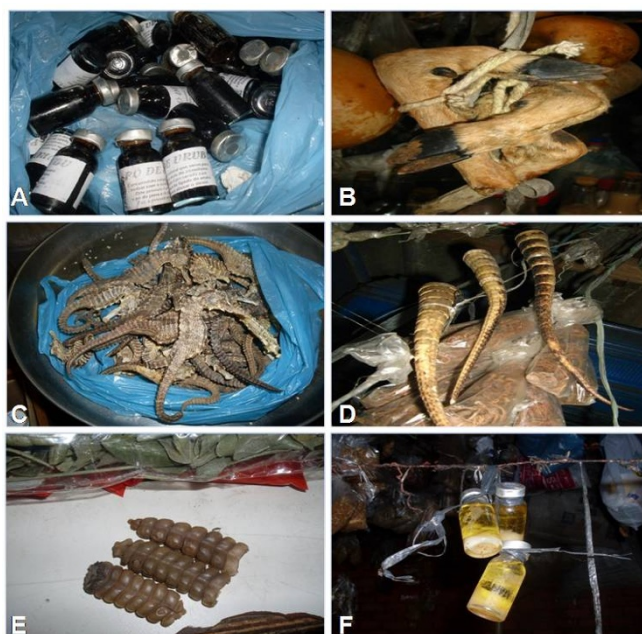
Figure 3 Examples of animal products used as remedies in that are sold in public markets in Crato and Juazeiro do Norte. A: Liver powder of Coragyps atratus , B: Hoof of Mazama sp., C: Dried Seahorses ( Hippocampus reidi ), D: Tail of Euphractus sexcinctus , E: Rattle of Crotalus durissus , F: Fat of Tupinambis merianae (Photos: Samuel C Ribeiro).

asthma, while its fat is used in to treat rheumatism and bruises. The fat from Hoplias malabaricus is utilized in the treatment of inflammations, urinary infections, and ear-aches.