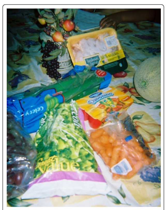
Figure 4 "Their favorite soup" . Sofia took and named this photograph of foods purchased at the store-frozen broccoli, fresh baby carrots, celery, cantaloupe, individual yogurts and fresh chicken. She commented: "Well this is what I am going to prepare for them during the day...it is a dish they asked me for, primarily, that they wanted to eat, so I made it. [It's for] a soup, but I didn't put much chicken in it. Because they don't like chicken that much. They like vegetables more than anything like carrots, celery, broccoli...They tell me, Thank you, Mommy for making us this to eat'...Every time I make something for them to eat, they thank me."

nourishment (providing foods to meet basic need for food or limit hunger), and nutrition (specific health benefits associated with food including "good", low-fat foods). Other values including taste (the flavors of the food), quality (the superior nature of a mother's homemade food compared to foods made by others), health (the physiological benefits associated with eating certain foods), variety (of dishes and accompaniments offered at eating occasions and variety of meals) and tradition (cultural and family practices that were incorporated and sustained through mother's food activities) were less emphasized among all mothers, but nonetheless significant to individual mothers. These values were discussed in context of a mother's exceptional care-giving to her family.