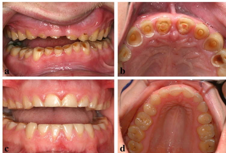
Figure 1 Tooth wear in PWS. (a, b) Extreme tooth wear with pulp exposure in 6 teeth in a 36-year-old male, (c, d) Typical tooth wear in a 28-year-old female.

individuals in the study group ( n = 2 > 18 years, n = 1 < 18 years).