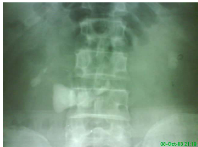
Figure 1 KUB showing stones in a horseshoe kidney with stones extending in the isthmus.

After obtaining the patients' informed consent to carry out the surgery including their approval for potential use their anonyms medical data from our data base for research and audit purposes. a dose of perioperative antibiotic is administered with the induction of general anesthesia. Cystoscopy and ureteric catheterisation are initially performed in the lithotomy position. In case of impacted stone in the pelvis or pelviureteric junction, an opened tipped 6F ureteric catheter is passed over a J-tip guide wire. The patient is then turned to the prone position. Bolsters