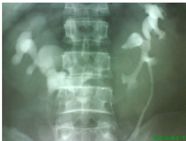
Figure 3 preoperative IVU.

Nephroscopy is then carried out, using a rigid nephroscope. Following stone visualization, fragmentation and