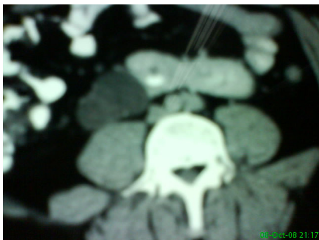
Figure 2 CT scan showing isthmus stone in a horseshoe kidney.

are placed underneath the patient's abdomen in order to fix the kidney, pushing it posteriorly and limiting its movement during respiration.