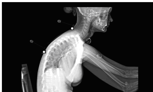
Figure 4 LODOX image.

was estimated as Pearson r correlation coefficients, calculated between the mean angles from the two photographs, and the LODOX measures for each posture (normal, slumped and upright). Bland Altman, with the 95% limits of agreement equivalent to the mean difference \pm 2 SD was also calculated to compare the angle values of the photographs and radiographs. Reliability was calculated between the angles from the five repeated photographs. Five repeated photos were taken for reliability study, this excluded photos taken for the validity study. Reliability was determined from the interclass correlation coefficients (ICCs) by means of the 2-way model and Standard Error Measurement (SEM) [37], with the strength of the ICCs interpreted as <0.50 = poor, 0.50 < 0.75 = moderate, 0.75 < 0.90 = good and > 0.90 = excellent. The ICC and SEM convey different information about reliability of a measure.