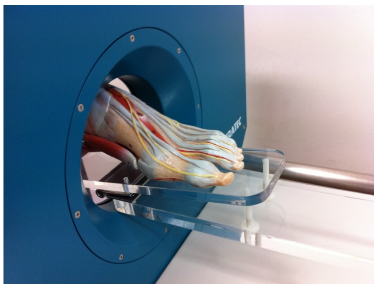
Figure 1 Custom designed acrylic foot plate and foot model illustrating the experimental pQCT protocol.

to assess metatarsal length and to provide an anatomic reference line. The reference line was positioned at the most distal portion of the 2 nd metatarsal. Sixty-six scans ( n = 66 ) were obtained at 15% (distal end) and 50% (mid shaft) of the 2 nd metatarsal (Figure 2). As single scans were acquired at these sites, no averaging of multiple slices was required. Each slice obtained was 2.2 mm wide.