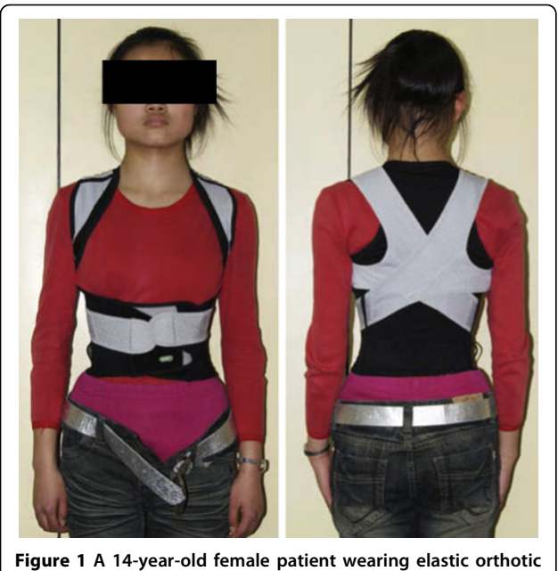
Figure 1 A 14-year-old female patient wearing elastic orthotic belt. Two straps twine around the bilateral shoulder joints to the back, then cross on the back and further extend to the front of the trunk.

such as humpback and trunk tilt. However, it was also misused by many parents who mixed the back asymmetry of AIS up with unhealthy standing and sitting postures. Some patients preferred the elastic orthotic belt even after they were prescribed to start standard brace treatment by doctors, for this new appliance is more flexible and comfortable than rigid brace, and also for the manufacturer publicly advertised its effectiveness on correcting scoliosis.