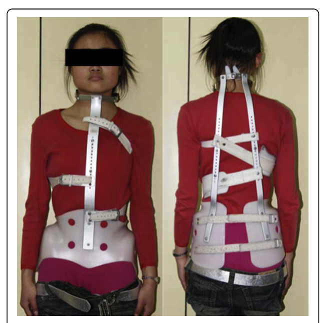
Figure 2 The same patient wearing Milwaukee brace . The neck ring cause a stimulant effect on the mandible, and two contact pads are located on the posterolateral part of the thoracic cage.

A total of 28 female thoracic AIS patients were included in this study from December, 2008 to January, 2010. All these subjects underwent careful clinical and radiologic examinations to confirm the diagnosis of AIS. They were new patients without any previous treatment and were prescribed to start standard Milwaukee brace treatments in our institution (Figure 2). All these patients had single structural thoracic curves. The average age of the patients was 14.0 years (range 12-16 years), the average Risser sign was 1.8 grades (range 0-4 grade), and the average Cobb angle was 29.6° (range 20°-44°). The apical vertebra was located in T7 in 6 patients, T8 in 11 patients and T9 in 11 patients (average 8.2). The upper end vertebra was located in T4 in 5 patients, T5 in 11 patients and T6 in 12 patients (average 5.3). The lower end vertebra was located in T10 in 4 patients, T11 in 14 patients and T12 in 10 patients (average 11.2). Two patients were before menarche. The average postmenarche age of the other 26 patients were 12.4 months (range 1~25 months). Informed consents were obtained from all the subjects and their parents. The study had been approved by the Clinical Research Ethics Committee of the hospital.