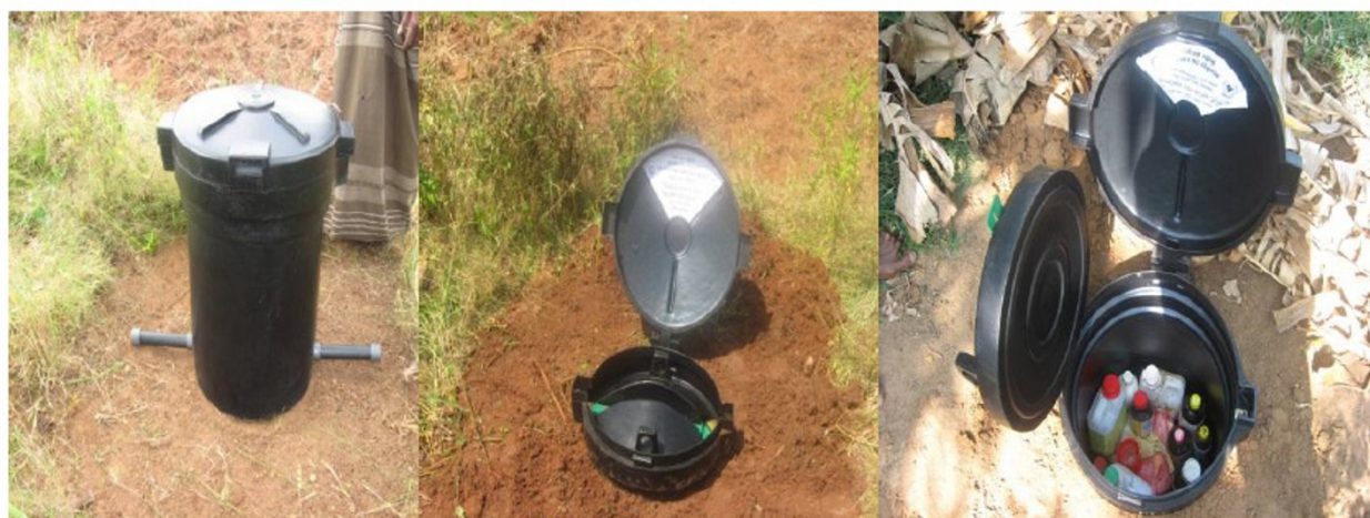
Figure 3 Safe storage device for agrochemicals in Sri Lanka. The UV-resistant plastic pesticide storage container to be used in this study. A) Device before installation: the metal bar at the base secures the device from theft. B) Device buried with two lids to protect the padlock from weather damage. C) Device can store several large and small bottles of pesticides.

pesticide self-poisoning, both fatal and non-fatal, amongst villagers aged 14 years or older, over the three-year study period. Secondary outcomes will include the incidence of: pesticide poisoning in general (deliberate and accidental, all ages), self-harm (all methods, both fatal and non-fatal), self-poisoning (all substances) and pesticide poisoning in children (younger than 14 years).