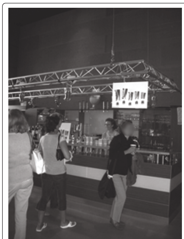
Figure 1 Display material in the experimental condition.

Participants were recruited through announcements in local newspapers, radio, and on the internet. Other recruitment methods included posting flyers in