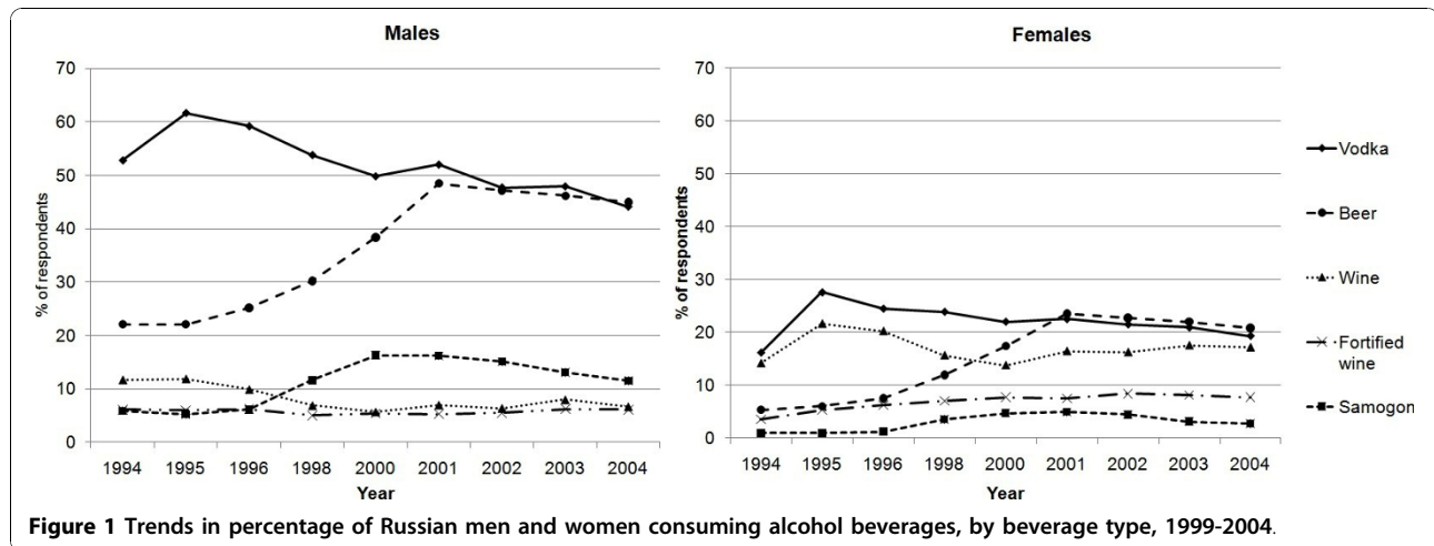
Figure 1 Trends in percentage of Russian men and women consuming alcohol beverages, by beverage type, 1999-2004.

of vodka consumers declined from 61% to 44% in men and 27% to 19% amongst women. The proportion of wine drinkers also fell substantially during the earlier rounds. Conversely, between 1994 and 2001, the percentage of beer drinkers increased dramatically from 22% to nearly 50% of men and 5% to 20% of women, and samogon consumers increased from 5% to 16% of men and from less than 1% to nearly 5% of women. The greatest rises occurred between 1996-1998 (the year of the financial crisis) and between 1998-2000.