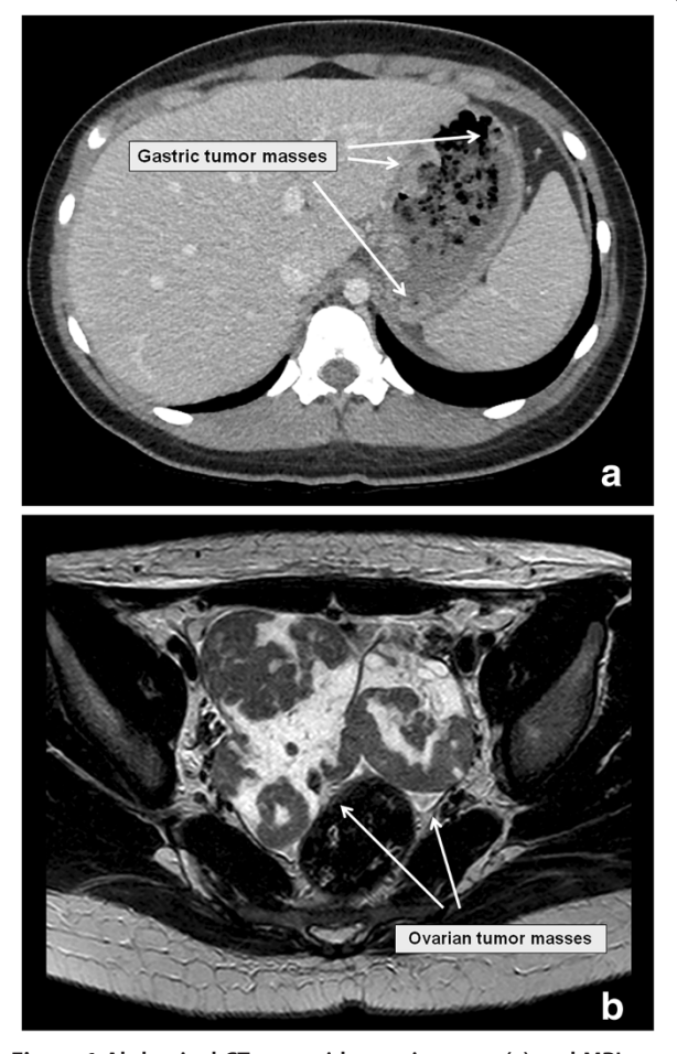
Figure 1 Abdominal CT scan with gastric tumor (a) and MRI showing bilateral ovarian masses (b).

stage III, Group B according to Murphy Stages. EBV encoded small RNA (EBER) in situ hybridisation showed an 80% consistency with Epstein Barr Virus (EBV). Finally, the typical reciprocal chromosomal translocation involving the proto-oncogene c-MYC on chromosome 8 and the immunoglobulin-gene heavy chain locus on chromosomes 14 [t(8;14)] was found in the tumor cells. Bone marrow aspirate and biopsy, as well as cerebrospinal fluid (CSF) were normal.