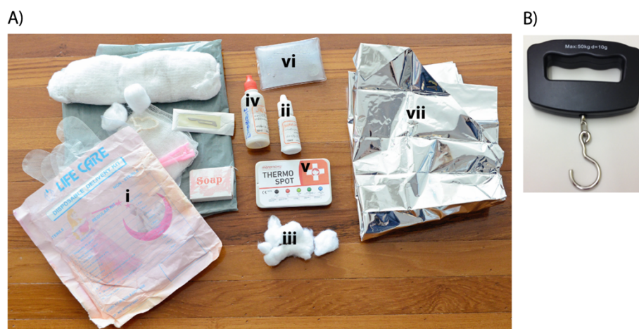
Figure 1 Integrated neonatal kit contents. A) The neonatal kit includes a i) clean delivery kit, ii) 4% chlorhexidine solution that is to be applied with iii) cotton balls, iv) sunflower oil emollient, v) ThermoSpot, vi) a reusable instant heat pack, and vii) a Mylar infant blanket. B) A handheld battery operated weighing scale will be provided to LHWs in the intervention cluster.

utilization and evidence surrounding each kit component. Importantly, while the efficacy of most kit components have been validated in isolation, their combined impact remains unclear. In addition, the effectiveness of several kit components, when implemented in community-based settings and delivered entirely by non-health workers remains to be evaluated.