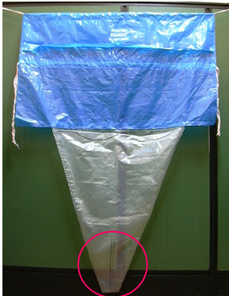
Figure 1 Photo of the Excellent BRASSS-V Drape™, a blood collection drape with a calibrated collection pouch.

All women aged 18 and older presenting at the study site (KEM Hospital in Pune, India) for an imminent vaginal delivery were considered eligible and were invited to join the study. Women who agreed to participate were randomized to one of the two measurement methods. Cards indicating group allocation were placed in opaque sequentially numbered envelopes, randomized in blocks of 10 via a computerized randomization sequence generated in New York by Gynuity Health Projects staff. Envelopes were opened by study staff after enrollment. All participants received the standard care provided during the third stage of labor at the study hospital. Provider actions related to the prevention or treatment of PPH (including blood loss interpretation) were as per provider preference and standard hospital practice and not dictated by the study protocol. Standard active management at KEM Hospital is 10 units oxytocin IM or IV immediately after the birth of the shoulder of the baby. Any participant who was referred for a cesarean section was withdrawn from the study post-randomization; the