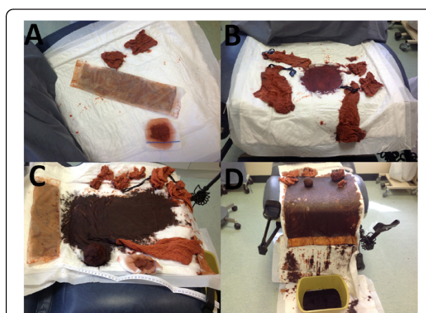
Figure 1 Simulated blood loss stations representing: A, less than average blood loss (250 ml); B, average blood loss (500 ml); C, more than average blood loss (950 ml) and D, excessive blood loss (2000 ml).

After all the participants completed phase one, we implemented the research intervention. We have conducted education sessions on how to accurately assess blood loss