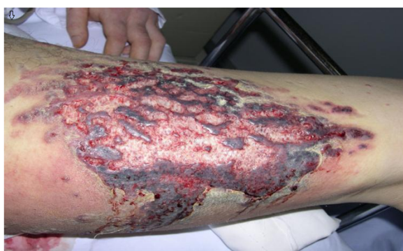
Figure 1 Massive shallow ulcers on the left inner thigh surrounded by reddish, infiltrated steak.

reduction of dose step by step. In order to restrain the development of the disease, he was treated with 48 mg of Triamcinolone daily at local hospital. Before long, he presented with high fever, skin ulceration and severe pain of his Lower extremities without history of allergies or close contact to any animals. Although he had received antibiotics in another hospital, the cutaneous lesions gradually enlarged and sustained high fever continuously existed.