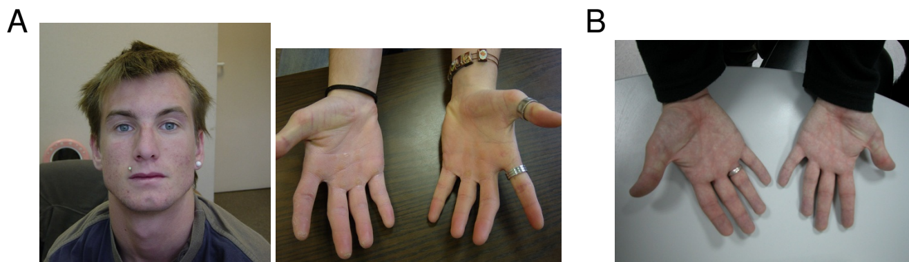
Figure 3 Facial appearance and hands of patients with Iq21.1 rearrangements. A: Patient V5 with microduplication/microdeletion Iq21.1: note frontal balding, arched eyebrows, deep-set eyes and thin upper lip, fingers with camptodactyly and mild interdigital membranes. B: Patient 112 with microduplication Iq21.1: Note moderate clinodactyly.

Two de-novo chromosome rearrangements were identified by aCGH and MLPA analysis in one patient with VCFS-like features. This is, to our knowledge, the first time that this combination of two CNVs (an interstitial microduplication, spanning 2 BAC clones with an estimate size of