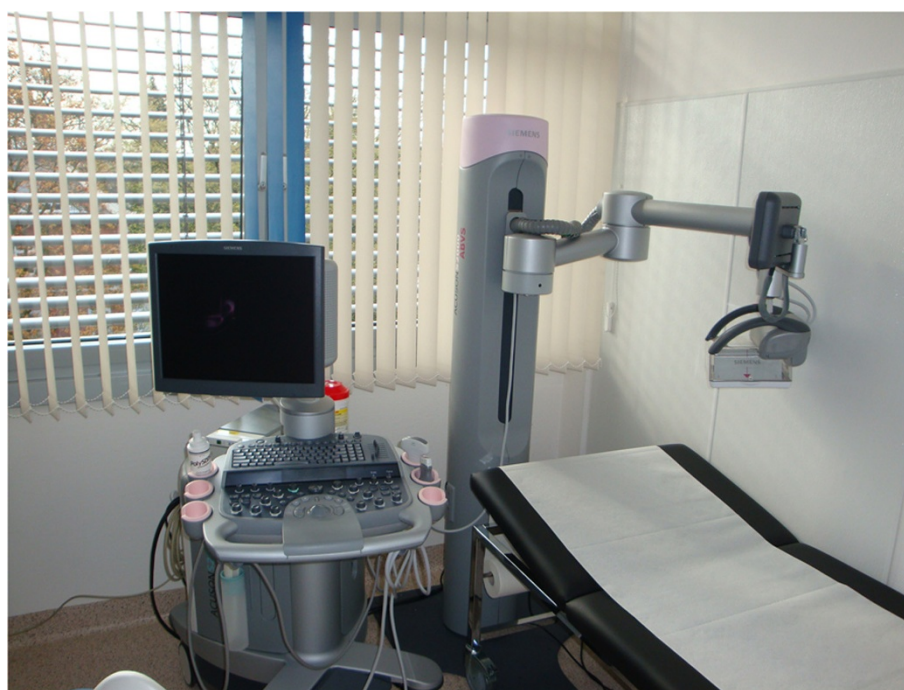
Figure 1 ACUSON S2000™ ABVS. On the left-hand side is the ACUSON S2000™ ultrasound machine, on the right-hand side is the 14L5BV volume transducer attached to a mechanical arm.

Conventional B-mode ultrasound examinations were performed by the author SW, a DEGUM (Deutsche Gesellschaft für Ultraschall in der Medizin, German society for ultrasound in medicine) level II certified senior consultant in gynecology with 8 years' experience in breast ultrasound [17]. This examiner also knew the results of the other imaging modalities when available (mammography, magnetic resonance imaging) and, therefore, defined the reference standard for the interpretation of the volume data sets. The conventional ultrasound