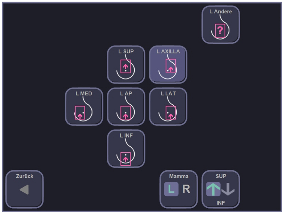
Figure 3 Predefined positions of the scanner for the left breast that are used to cover the entire volume.

According to the national regulatory authority statutes, breast US systems have to fulfill basic technical requirements and undergo regular quality control measures [18]. These standards applied to the equipment used in our study.