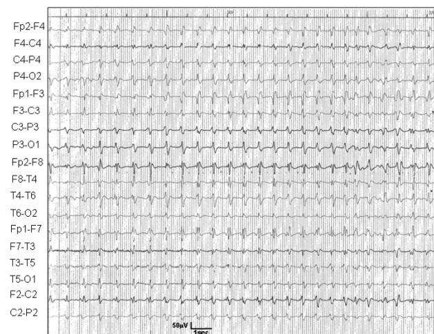
Figure 1 Electroencephalogram of the suspected CJD patient showing typical periodic bursts of triphasic sharp waves.

Cerebrospinal fluid (CSF) was collected by lumbar puncture. Both the lumbar puncture and the EEG, were performed three and eight days after the patient's admission to the hospital (about six months after the occurrence of the reported symptoms observed by family members).