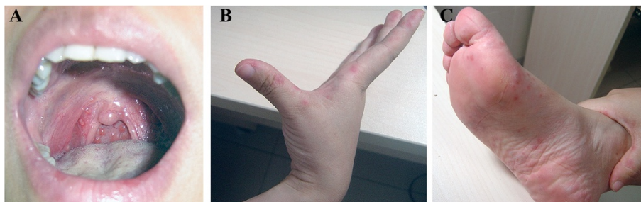
Figure 2 A typical adult HFMD patient presenting with fever, sore throat, and blister-like rash on the (A) oral mucosa, (B) hands, and (C) feet.

All adult HFMD patients in this study had herpetic lesions on the hands, feet, or oral mucosa. However, not all of them had fever, and none had severe complications. Few patients had white blood cell counts over 10,000/ \mu\text{L} , and none had X-ray-confirmed pneumonia.