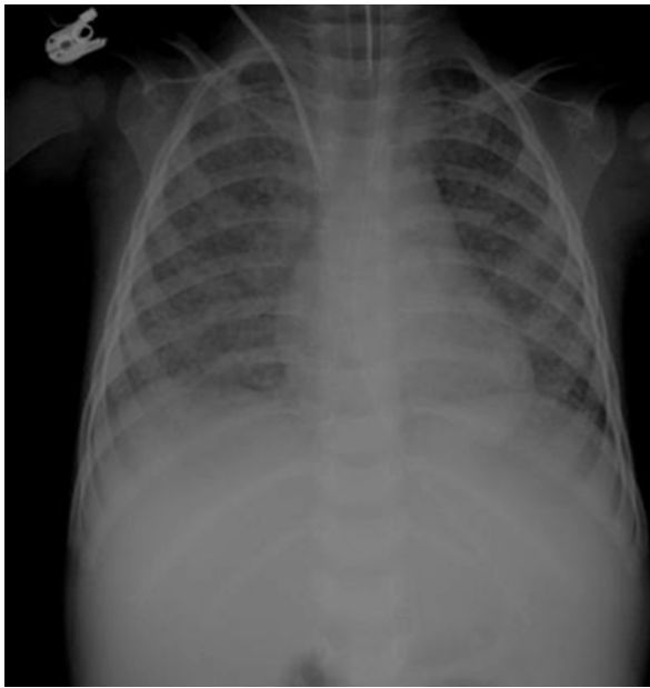
Figure 1 Chest X-Ray. Diffuse, bilateral, small lung nodules suggestive of acute miliary pulmonary tuberculosis.

and revealed a voluminous left atrial intracavitary pedunculated mass prolapsing during the diastole from the right lower pulmonary vein into the left ventricle through the mitral valve (Figure 2). No mitral stenosis and only trivial mitral regurgitation were noted. The patient was immediately transferred to the cardio-surgical unit and complete excision of an homogeneous and yellowish in color mass was performed through median sternotomy, under cardiopulmonary bypass. Histopathological examination of the removed mass revealed fibrotic tissue with mixed inflammatory cells and necrotic debris with a vaguely granulomatous appearance and AFBs were found. PCR for Mycobacterium tuberculosis complex was positive on the removed mass and on previous gastric aspirates.