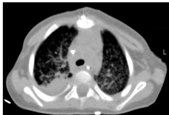
Figure 3 Chest Computed Tomography. Innumerable tiny, well-defined, miliary nodules throughout the lungs, and bronchovascular structures, a consolidation with air bronchogram in the posterior segment of the right upper lobe and an initial consolidation in the lateral segment of the right inferior lobe with evident local bronchiectasis.

Cardiac TB is a rare disease and it most usually manifests as tuberculous pericarditis [3]. Involvement of other parts of the heart is unusual and descriptions in