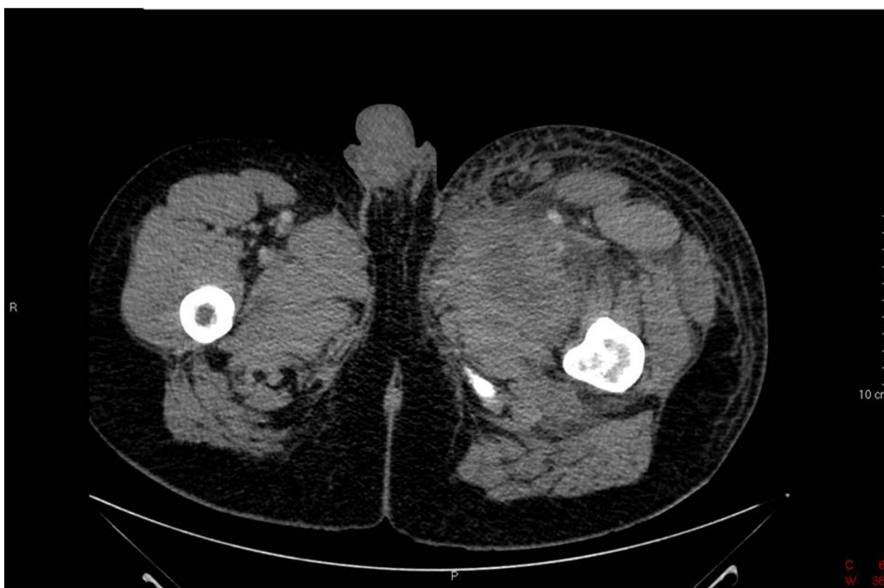
Figure 2 CT Abdomen and Pelvis. The adductor magnus which is oedematous possibly reflecting muscle necrosis.

when full. He was discharged on a 4 week course of oral Ciprofloxacin 400 mg twice a day and continued with NPWT. Following 4 weeks of treatment, the wound dimensions had reduced from 300 cm 3 [Figure 4] to 68 cm 3 [Figure 5], a reduction in size of 77%. He remains well and attends regular review at outpatient clinic.