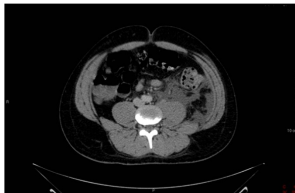
Figure 1 CT Abdomen and Pelvis. Loculated fluid and inflammatory change anterior to the left psoas muscle.

Given that he was clinically well his conservative management and monitoring continued. Over the next five days there were signs of improvement with a reduction in