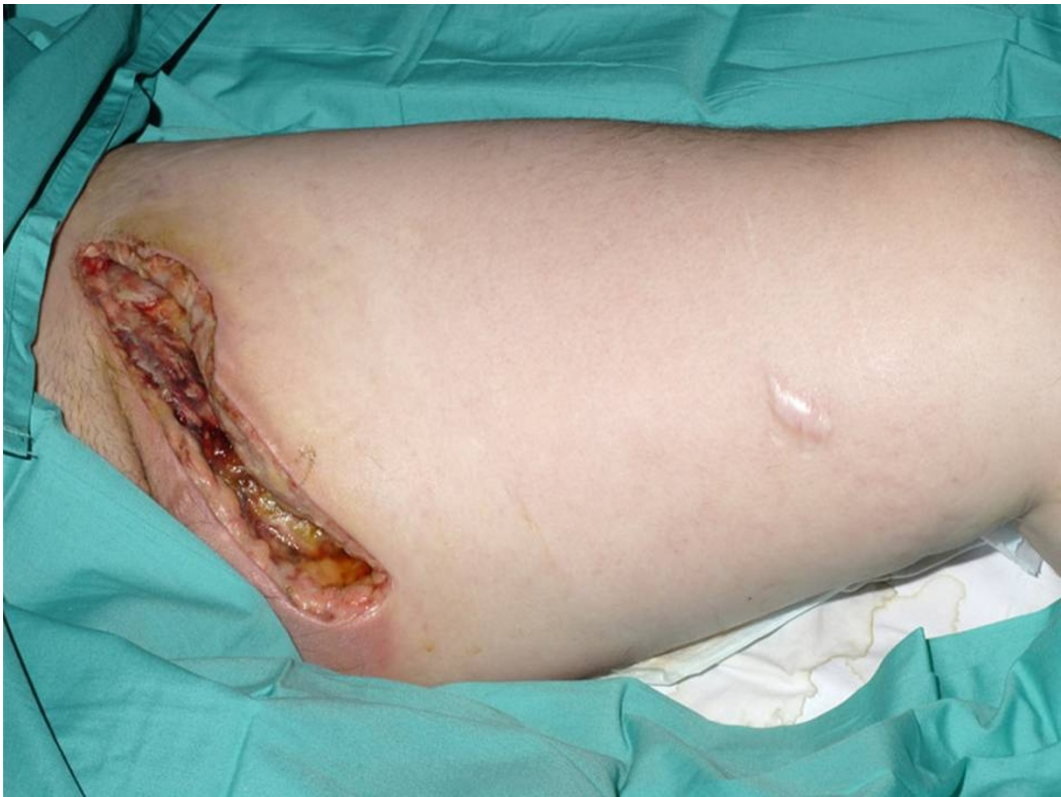
Figure 4 Appearance of the wound prior to the use of NPWT.