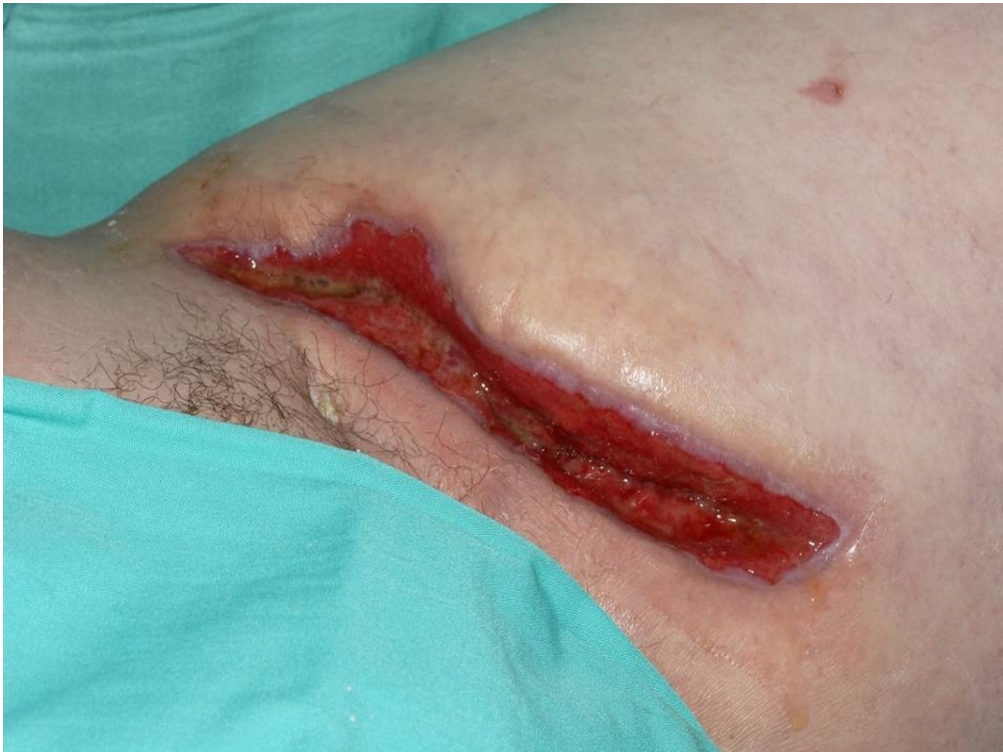
Figure 5 Appearance of the wound following 4 weeks of NPWT.