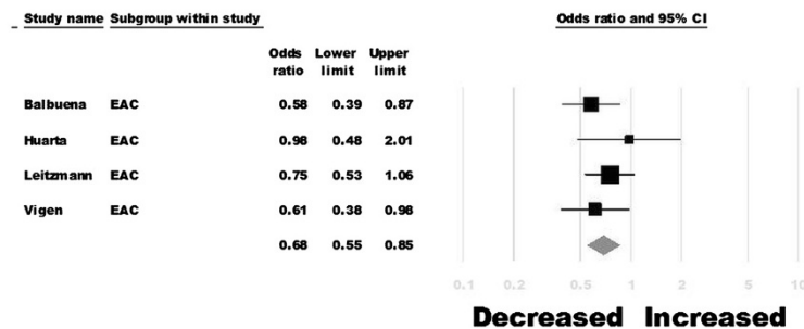
Figure 3 Physical activity and risk of esophageal adenocarcinoma.

ESCC in patients with the highest level of occupational physical activity. On meta-analysis, there was no association between physical activity and risk of ESCC (OR, 1.10; 95% CI, 0.21-5.64), albeit with considerable heterogeneity ( I^2 = 95\% ).