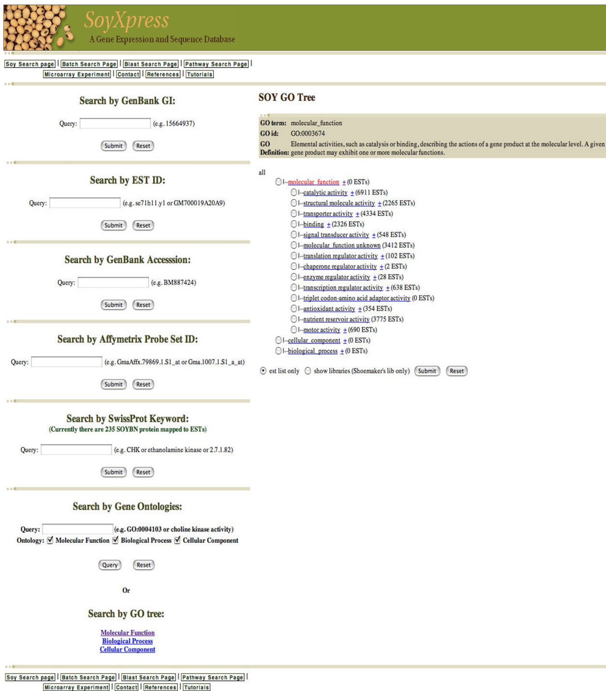
Figure 1 The main page of the soy database. Users can submit queries to the database to retrieve all available IDs and annotations for the soybean transcript of interest. Queries can be made using EST ID, GenBank accession number, GenBank GI number, Affymetrix probe Set ID, SwissProt protein ID, name or keyword, GO number or term. A clickable GO tree is available to assist searching for a GO term from the gene ontology hierarchy structure.