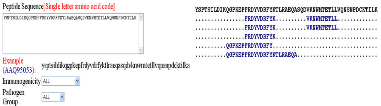
Figure 5 Mapping of B-cell epitopes on antigen sequence, a) submission page of B-cell epitope mapping, and b) mapping results

their experimentally determined B-cell epitopes. We hope that immunologists will submit their information on B-cell epitope in Bcipep, similar to the sequence data at GenBank and SWISS-PROT. The Bcipep team will add more data from literature to maintain B-cell data up-to-date and cross check the data submitted by users to maintain quality of the data.