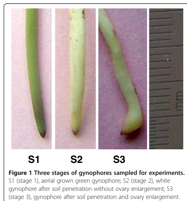
Figure 1 Three stages of gynophores sampled for experiments. S1 (stage 1), aerial grown green gynophore; S2 (stage 2), white gynophore after soil penetration without ovary enlargement; S3 (stage 3), gynophore after soil penetration and ovary enlargement.

A total number of 13293536 reads corresponding to about 120 millions (1196418240) of nucleotides were generated by high throughput sequencing of the gynophore cDNA pool using Illumina HiSeq™ 2000. The raw reads that only have 3' adaptor fragments were removed before data analysis. Short sequences assembly was performed using SOAPdenovo assembling program to form contigs and scaffolds [17]. More than 353 thousand contigs were