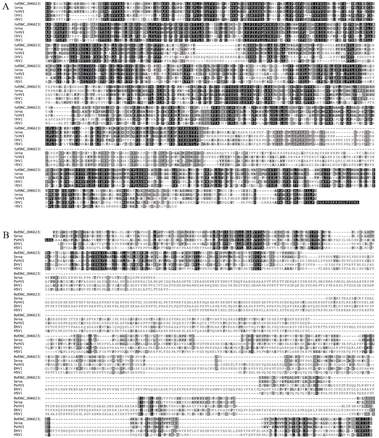
Figure 2 Amino acid alignment of predicted translation products of homologous genes from the Serva ILTV strain, the concatenated ILTV reference sequence and other alphaherpesviruses. (A) UL29 gene product. (B) C terminal part of the UL36 gene product. Black boxes indicate 100% identity, dark grey boxes indicate 80-99% identity and pale grey boxes indicate 60-79% identity. Dashes indicate single amino acid gaps in sequence alignments. Alignments were performed using Clustal W version 2.0. The Blossum62 matrix was used to score sequence alignments.