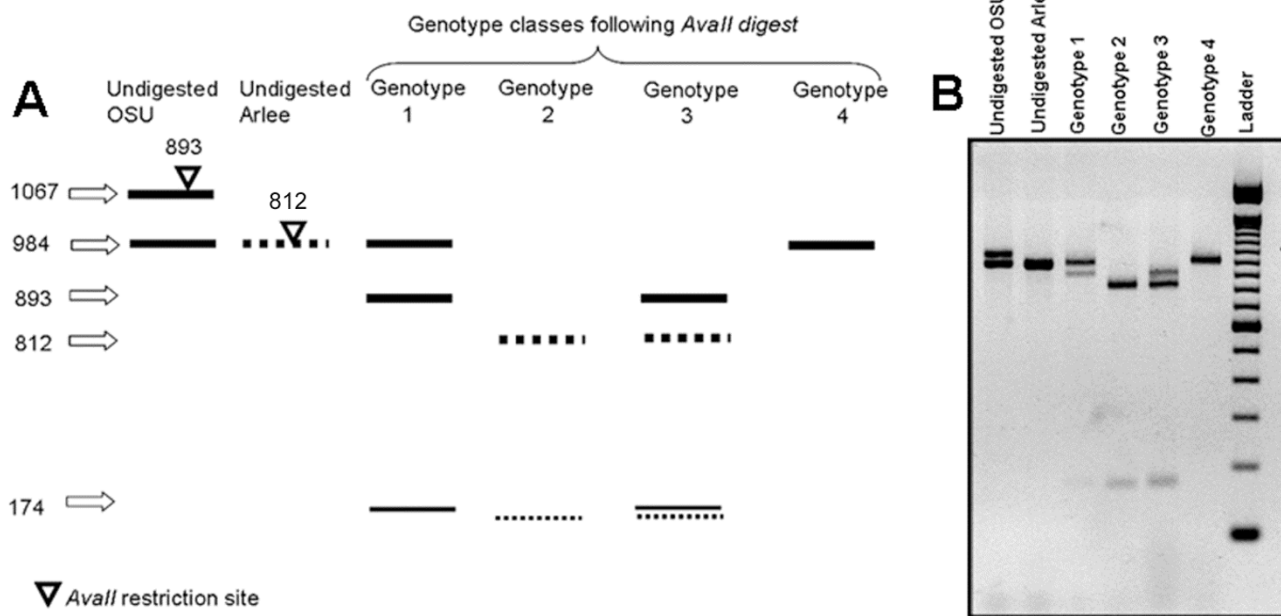
Figure 2 Inheritance of Sox6 alleles in the rainbow trout OSU × Arlee mapping family. (A) A schematic diagram showing the different Sox6 alleles in OSU and Arlee parental lines and the different genotype classes that were observed in doubled haploids of the OSU × Arlee mapping family. The OSU alleles are shown in solid lines while the Arlee alleles are shown in dashed lines. Restriction sites of AvaII enzyme are indicated by an inverted triangle on each respective Sox6 allele. The distance of each restriction site away from the 5' end of each respective allele is indicated above the triangle. Sizes of the different Sox6 alleles before their digestion with AvaII and the sizes observed in the mapping family following AvaII digestion are indicated with arrows. (B) A 2% agarose gel image of the different Sox6 alleles in OSU and Arlee parental lines and the different genotype classes observed in doubled haploids created by androgenesis from an OSU × Arlee hybrid. Look at part (A) for details.

The (A – null/OSU – Sox6ii ) genotype can also be explained by failure of the AvaII restriction assays. Genotyping was however confirmed by digestion with NlaIII which also produces a distinctive restriction profile for each of the