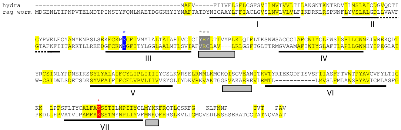
Figure 4 Novel Hydra opsin aligned with rag-worm ciliary opsin. As expected, the sequence conservation is highest in the seven transmembrane regions (underlined). The signature residue perfectly conserved in all opsins is the lysine that retinal forms a Schiff base with. This conserved position is shown in red. The position of the well-characterized glutamate counterion of some ciliary opsins, is instead a tyrosine in several ciliary opsins and all rhabdomeric opsins. Hydra ciliary opsin has a serine at that position. The cytoplasmic regions shown by mutagenesis to be critical for G protein interaction are underlined by gray boxes. The first of those cytoplasmic regions contains the highly conserved DRY element, which contains an arginine critical for G protein activation. That sequence is more similar in Hydra (YRY) than in rag-worm (VRC), shown by gray highlighting.

sistent with the fact that sponges use flavin or carotenoid photopigments [59].