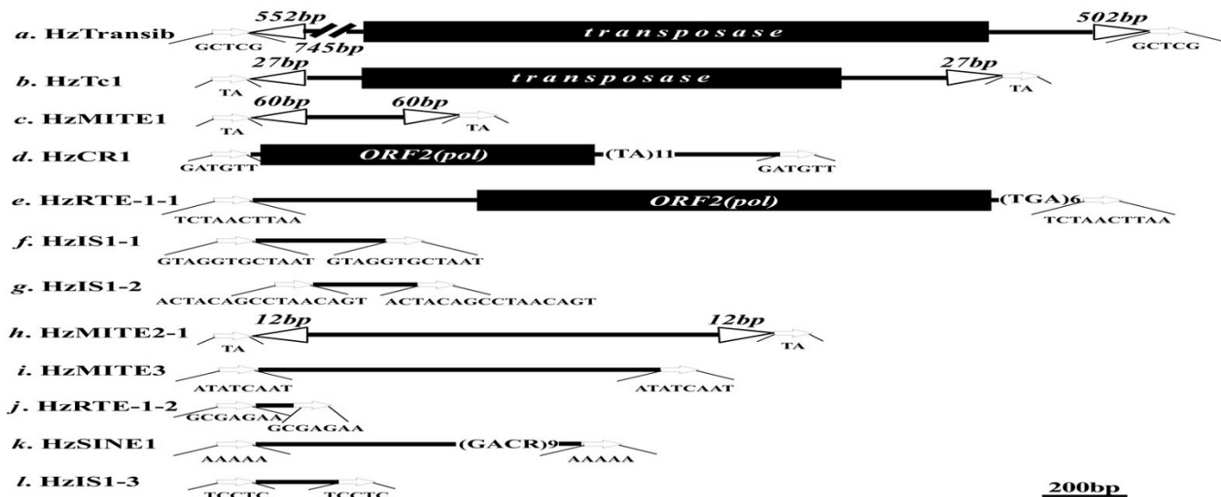
Figure 2 Schematic structures of the 12 transposons. The structure of the 12 transposons are drawn to scale (except for Hztransib ) with horizontal arrows representing putative TSDs (sequence shown underneath). Arrowheads represent TIR (length shown above), filled black boxes represent putative ORF and black lines represent non-coding sequences. Microsatellite sequences within some transposons are shown in parentheses, followed by the corresponding repeat number.

midgut cell line. The orthologous CYP9A genes obtained from the H. zea laboratory strain are designated as CYP9A12v3 (5.7 kb) and CYP9A14 (8.4 kb) (Nelson, personal communication). Sequence comparison with the cDNA sequences of the H. armigera CYP9A12 and CYP9A14 reveals that the two paralogous H. zea CYP9A