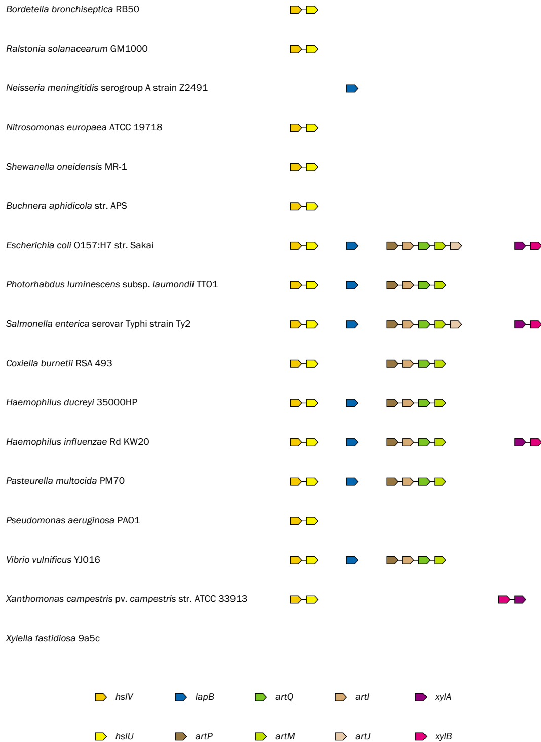
Figure 2 Conserved gene strings in 17 prokaryotic genomes analyzed in this study. For each protein searches were performed at the STRING server [57] with a high confidence score > 0.7. Colored arrows indicate orthology. Gene names are those reported in protein databases.