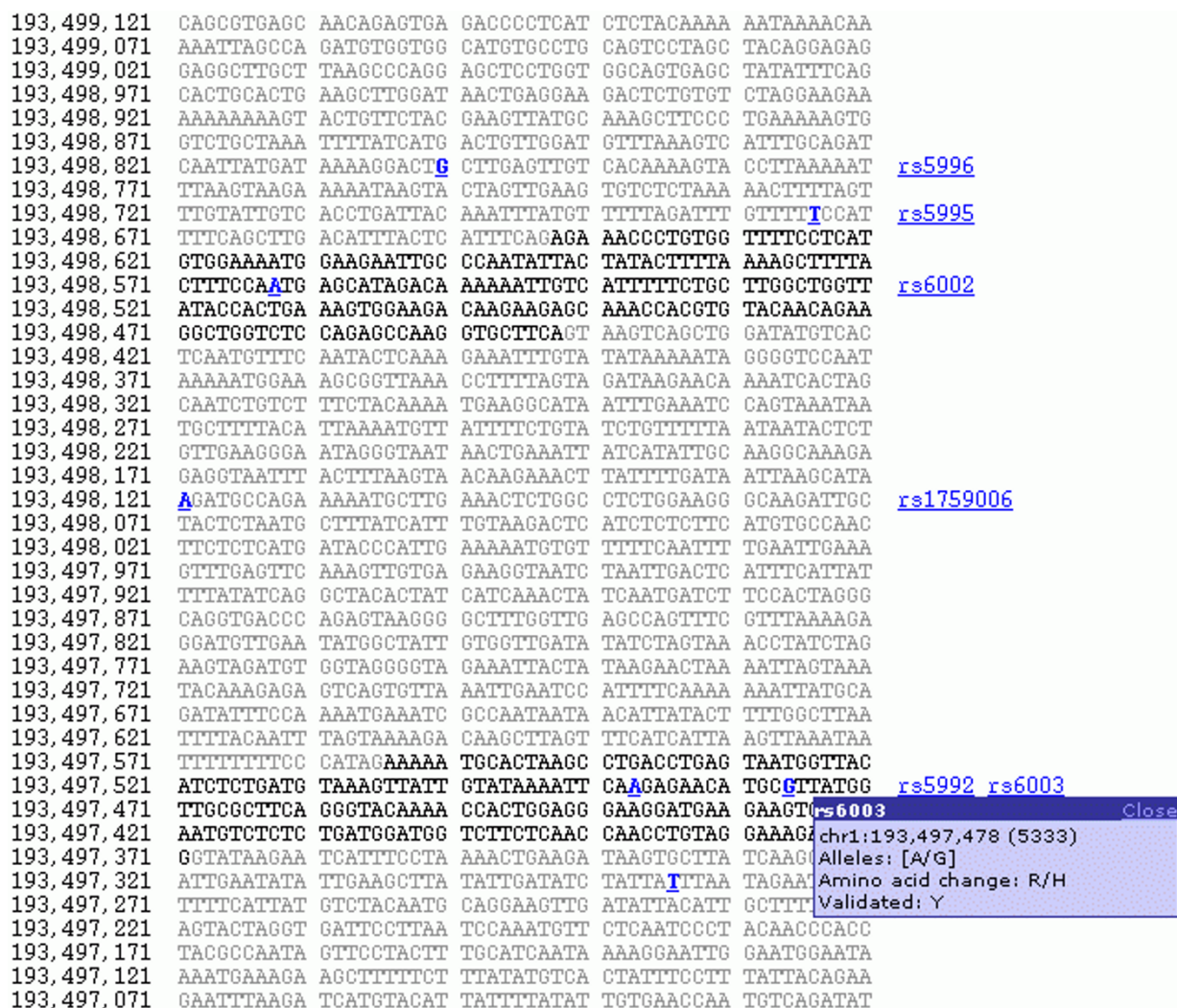
Figure 1 An annotated gene sequence containing SNPs. A portion of the sequence for gene F13B (on chromosome 1) is shown. Black areas represent exons, while introns are in gray. The nucleotide positions on the left are relative to the human genome assembly provided by Goldenpath. SNPs are indicated by bold, underlined nucleotides, and their dbSNP identifier appears to the right of the sequence. A pop-up window displays additional information about individual SNPs: in this example, SNP rs6003 is shown to be a validated, non-synonymous coding SNP.

colored in green if validated, black otherwise. The applet provides commands to scroll the display left or right, and to zoom the display in or out.