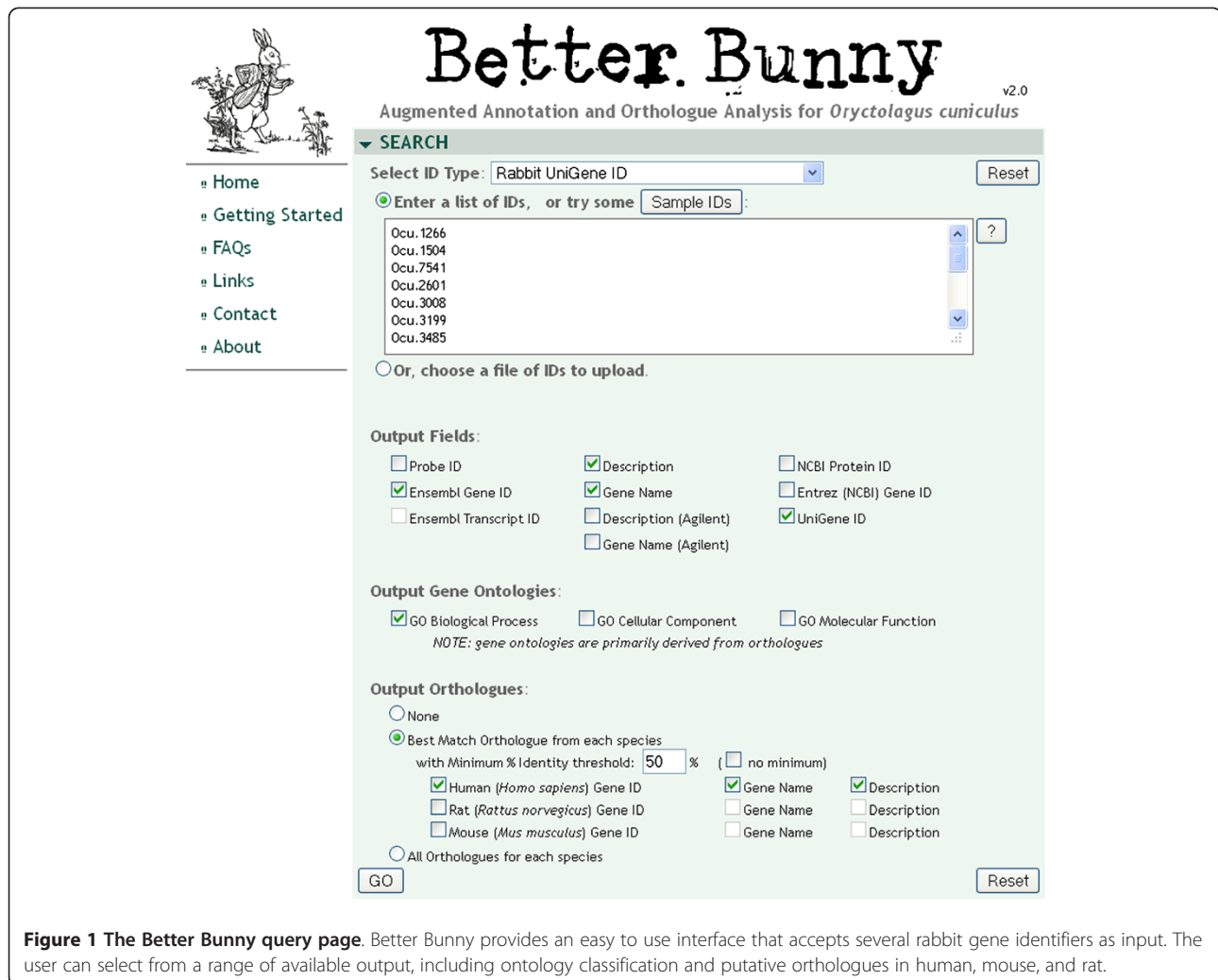
Figure 1 The Better Bunny query page. Better Bunny provides an easy to use interface that accepts several rabbit gene identifiers as input. The user can select from a range of available output, including ontology classification and putative orthologues in human, mouse, and rat.

investigators to perform functional annotation that may otherwise be unavailable. Orthologues can be selected from human, mouse, and rat. The orthologous relationships in Better Bunny are derived from Ensembl and are based on protein sequence similarity. Ensembl employs an automated orthologue identification pipeline that performs pairwise alignments (BLASTP) between all pairs of proteins for all available species [15]. The alignment is performed using the longest protein translation for each gene, and the percent identity displayed in Better Bunny is the value relative to the target (non-rabbit) species. Functional annotation transfer based on sequence similarity is widely used to establish putative function for poorly characterized proteins. While high sequence similarity is not a guarantee of similar function, studies have demonstrated that a threshold of 50-60 % identity ensures a high probability of similar function at the enzyme and gene ontology levels [16]. Better Bunny allows users to specify a minimum required percent identity for the selection of orthologues. An individual rabbit gene