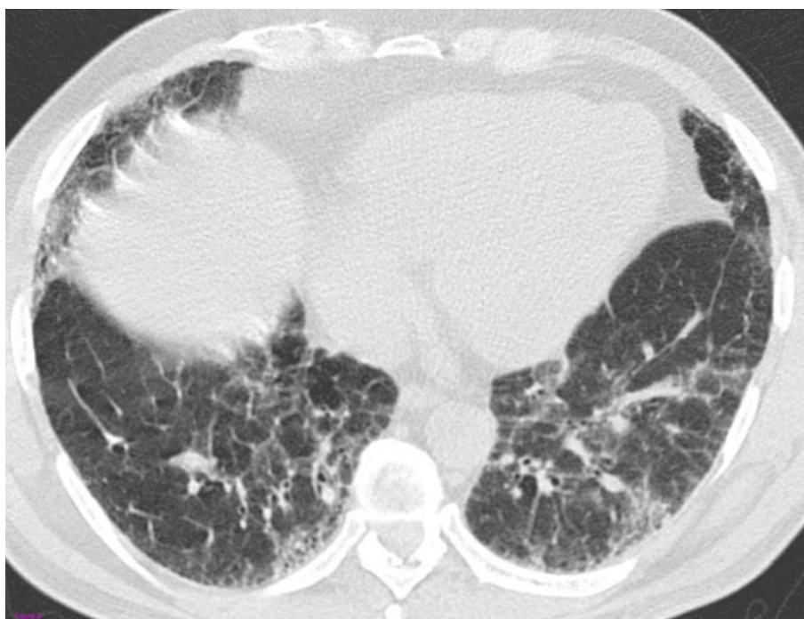
Figure 3 Biopsy-proved UIP with an HRCT pattern inconsistent with UIP. There are some patchy ground-glass and peripheral reticular opacities, which are more suggestive of nonspecific interstitial pneumonia (NSIP).