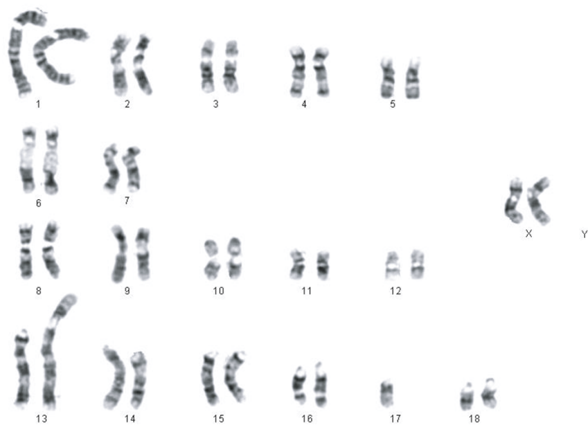
Figure 2. GTG-banding karyotype of a gilt carrier of the 13/17 Robertsonian translocation.

NB: The rearrangement was initially identified in a boar; daughters were produced for experimental purposes.