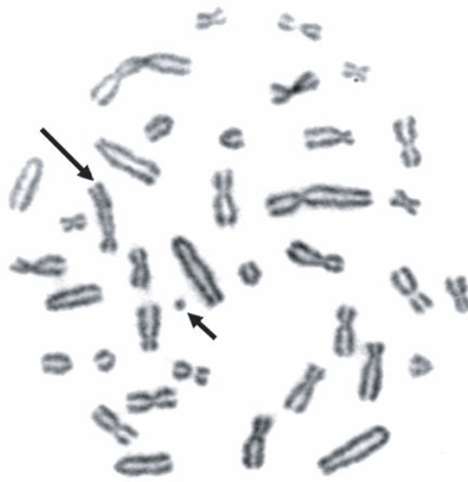
Figure 3. (a) GTG-banding karyotype of a boar carrier of the t(Y;14)(q10;q11) reciprocal translocation. (b) Metaphase spread of the boar conventionally stained with Giemsa.