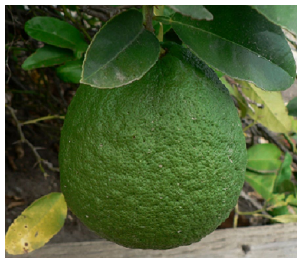
Fig. 1 Photograph of Citrus macrophylla fruit

The fruits of C. macrophylla are collected from Agricultural Research Corporation, Shambat area, Khartoum North, Sudan, in May 2016 at 35 °C and humidity of 8% (Fig. 1). The species is introduced by one of the authors Dr. Moawia E. Mohamed from the National Repository of Citrus and Dates of Riverside, California, USA. This collection is kept at Shambat Research Station (Mohamed and ElTayeb 2009). The voucher specimen is deposited in Herbarium of Botany Department, Faculty