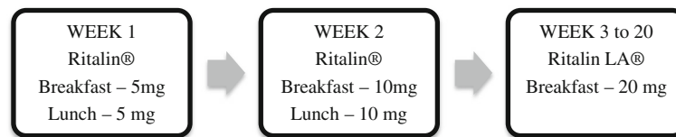
Fig. 2 Progressive administration of methylphenidate