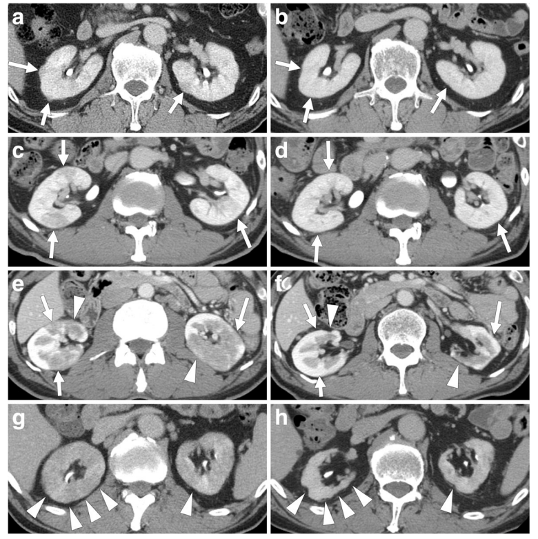
Fig. 1 Low-density lesions after glucocorticoid therapy. The outcome of low-density lesions after glucocorticoid therapy varied between individual patients and even between individual lesions: a, c, e, g pre-treatment; b, d, f, h post-treatment. Representative cases are shown: patient 10 ( a, b ); patient 17 ( e, f ); patient 22 ( g, h ). Patient 10 had small peripheral cortical nodules. Patients 15 and 17 had multiple, round or wedge-shaped lesions. Patient 22 had diffuse patchy involvement. Arrows show recovering lesions, and arrowheads show atrophic lesions

disease. Information on smoking history was available for 21 patients (52.4%), of whom 11 had a past or current smoking habit.