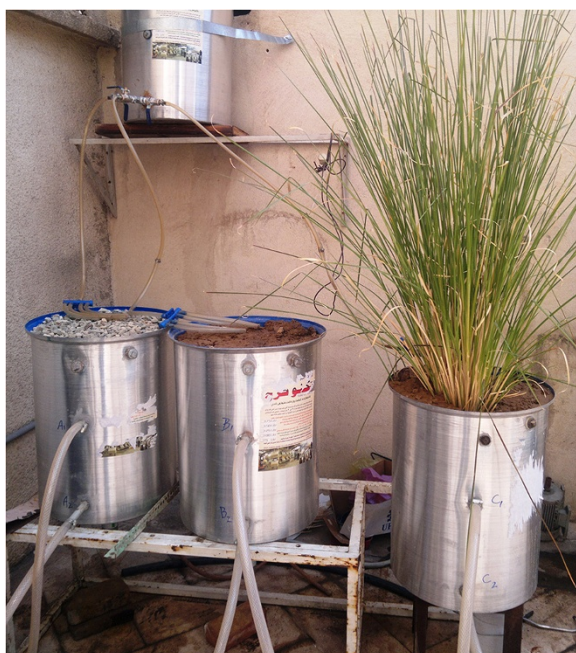
Figure 1 Stages leachate movements from storage to pilots.

As can be indicated, the analysis of the sample soil including the soil texture and composition are given in Table 4.