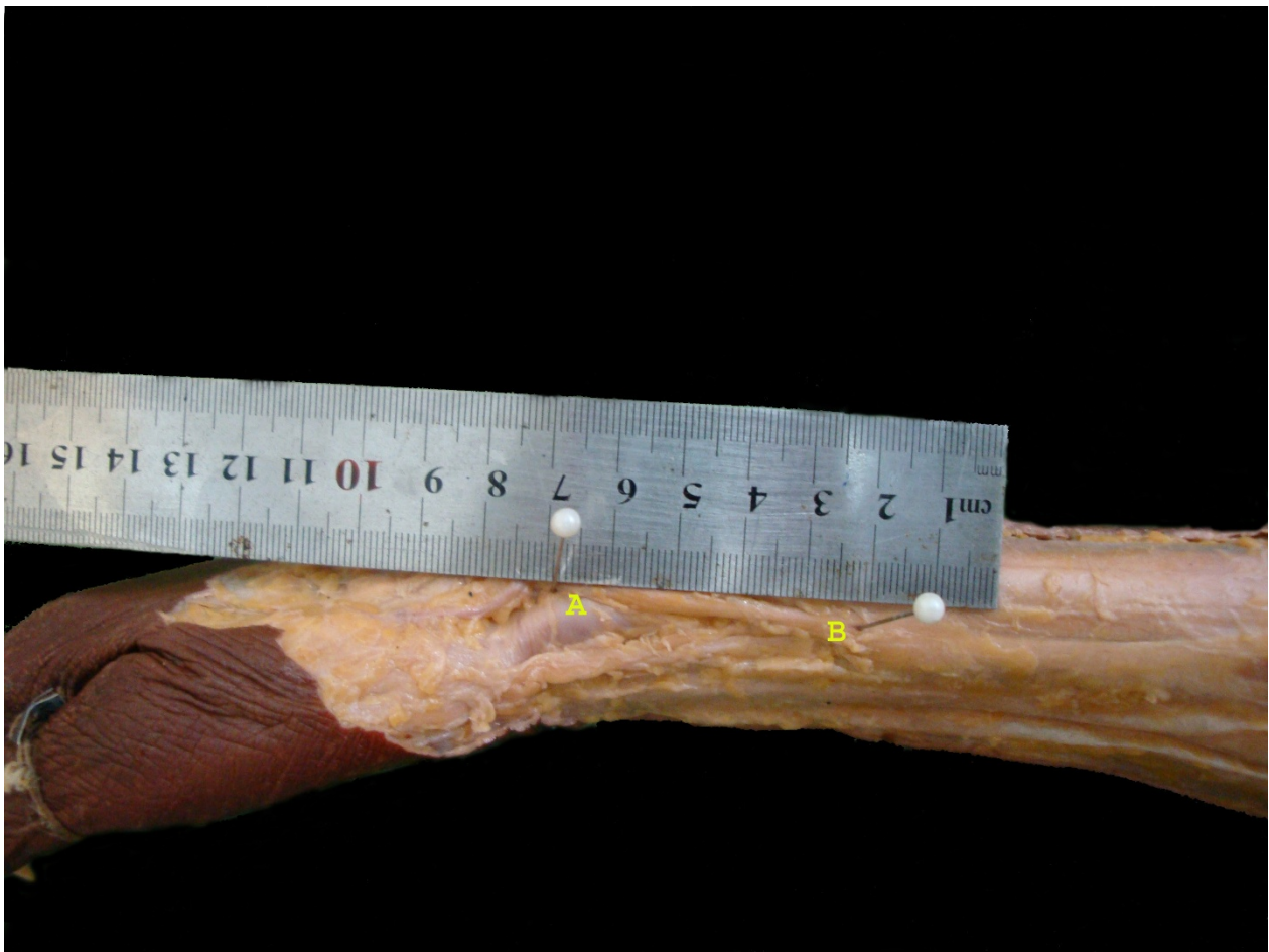
Figure 2 A dissected specimen showing the point of emergence of the nerve (B), with the reference point-Radial styloid (A).

radius in all 25 specimens studied. In the study of Abrams et al [7] it reached 11.6 cm and averaged 9.0 cm. Auerbach et al [9] reported similar distances, with an average of 8.6 cm (range, 6.1-11.8 cm). Robson et al [8] reported that the SBRN emerged from under brachioradialis by a mean of 8.31 cm proximal to the radial styloid. Our results are consistent with these studies as the differences were not statistically significant (Table 1)