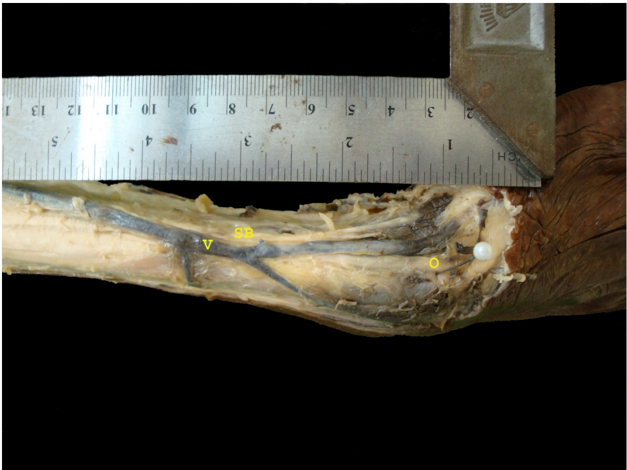
Figure 1 A dissected specimen showing superficial branch of the radial nerve (SB), Cephalic vein (V), And the reference point-Radial styloid (O).

measured along a plane perpendicular to the axis of the forearm, at the level of the Lister's tubercle (Figure 3). V1 was the point where the cephalic vein crossed the superficial radial nerve. Additional intersections if observed were likewise named as V2, V3 etc. OV1 and OV2 distances were measured along the axis of the forearm between the styloid process of the radius and the V1 or V2 points, respectively. All distances were measured with the aid of a caliper.