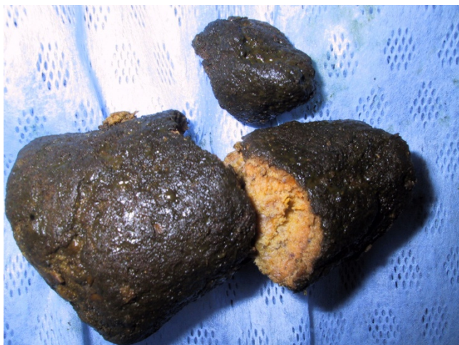
Figure 3 A 10 cm conical phytobezoar was found 20 cm distal to the gastrojejunostomy. It was removed by an enterotomy.

Bezoars tend to be rare, except in patients with previous gastric surgery [6] or gastrointestinal dysmotility. In a 10-year retrospective review of all patients with small bowel obstruction in a hospital in Hong Kong, the incidence of bezoar was reported as approximately 2% [7]. A 4-year study in an Italian unit confirmed a similar incidence with nine of 369 patients having bowel obstruction secondary to bezoars [8]. It appears that geographical or dietary variation does not participate in the risk of developing bezoar obstruction.