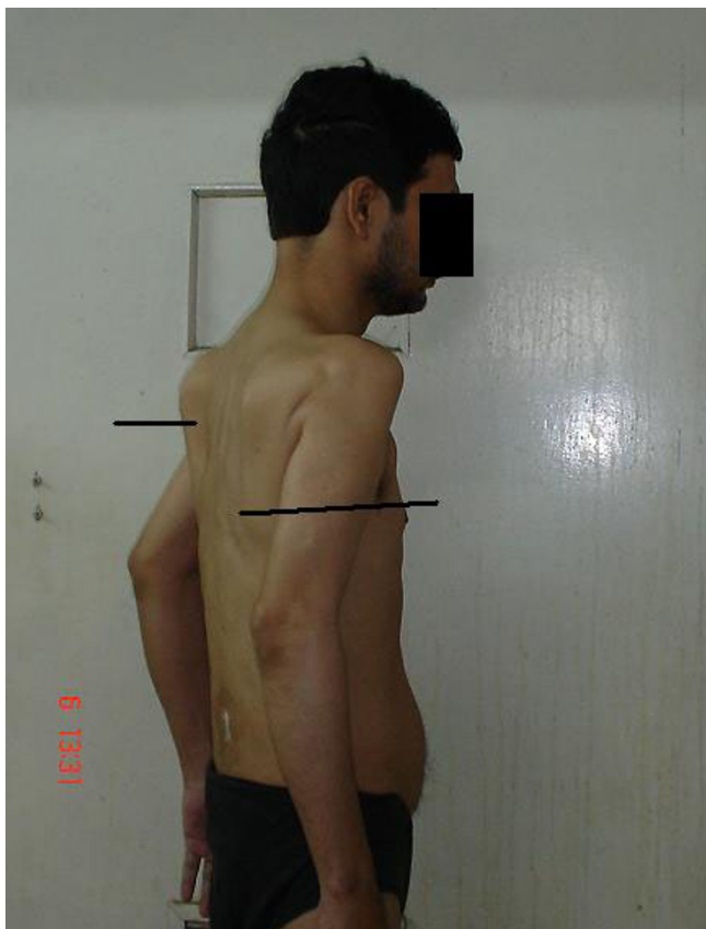
Figure 2 Wasting of the muscles around the shoulder joint (magnified view).

tions [3,4], with their patients presenting with woody induration of muscles with secondary contractures.