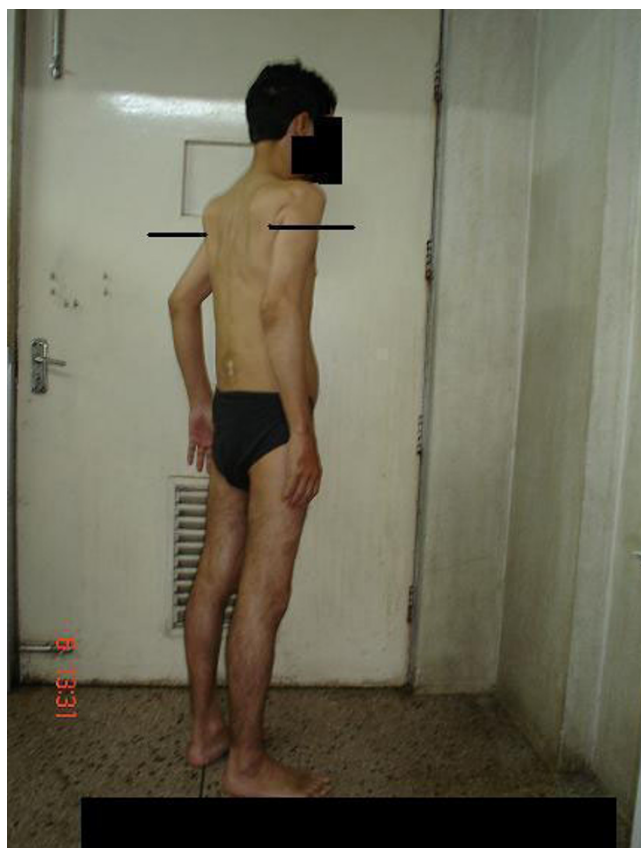
Figure 1 Wasting of the muscles around the shoulder joint.

On investigation, a full blood count, liver and renal function tests, serum calcium, phosphate, and creatinine phosphokinase were within the normal ranges. Roentgenogram of the lumbar-sacral spine, thigh, knee, chest, shoulder and cervical spine showed multiple soft tissue calcifications with hyperdensity of muscles (Figures 3, 4). There was no articular abnormality. Electromyographic examination of muscles was normal. Muscle biopsy showed atrophy with features suggestive of neurogenic involvement without active inflammatory signs.