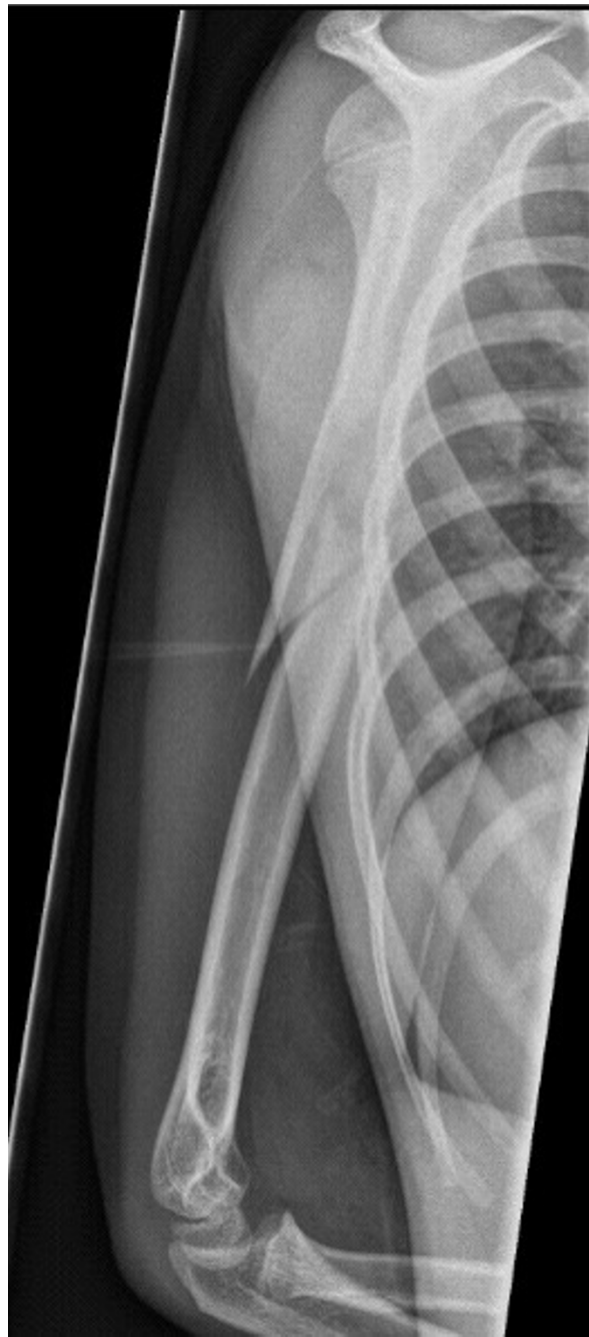
Figure 6 Patient presenting with acute pathologic fracture. Consolidation with ESIN, Orthoss® and GPS®. Pathologic fracture of the right humerus after a fall on wet grass.

consolidation of the cyst but they do not initially enhance the mechanical stability of the weakened bone [37]. As a consequence patients have to avoid strenuous activities and sports for the duration of the healing process, which might be years [6,16]. In our experience, this is not seen as a valid therapeutic option by parents and patients.