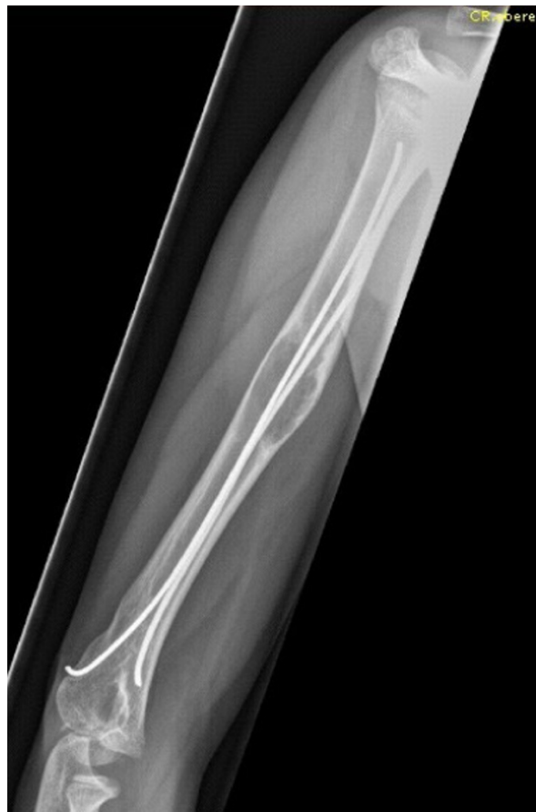
Figure 2 Failed Consolidation after treatment with nailing alone. Persistence of cyst after earlier failed treatment (Elastic stable intramedullary Nailing 4 years previously).

NEER supported prompt surgical intervention with curettage and bone grafting as “the best way to rehabilitate these young children” producing successful healing in 55% to 65% of cases [32].