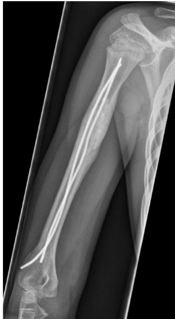
Figure 7 Patient presenting with acute pathologic fracture. Consolidation with ESIN, Orthoss® and GPS®. Lateral view X-ray five months after treatment with ESIN, Orthoss® and GPS®. As a consequence, Nails could be removed.

consolidation of the cyst but they do not initially enhance the mechanical stability of the weakened bone [37]. As a consequence patients have to avoid strenuous activities and sports for the duration of the healing process, which might be years [6,16]. In our experience, this is not seen as a valid therapeutic option by parents and patients.