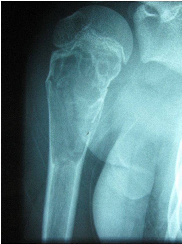
Figure 10 Incomplete filling of the cyst. Acute pathologic fracture of the right proximal humerus.

postoperative immobilization render this method unconvincing [13,38]. In our study earlier treatment with ESIN on its own had failed in four patients, which was also the case in another cyst that was additionally treated with a product containing tricalciumphosphate (Cerasorb®). The duration of their treatment history was four years and two of the children underwent multiple operations.