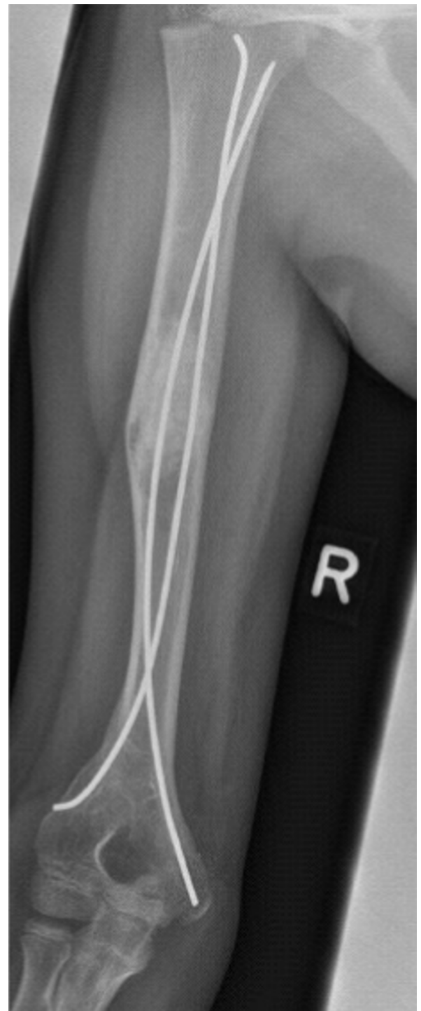
Figure 3 Failed Consolidation after treatment with nailing alone. Elastic stable intramedullary Nailing in combination with Orthoss® and GPS® after earlier failed treatment. Radiograph three months following the initial GPS®/Orthoss® treatment resulting in bone mineralization.

Other treatment strategies such as filling the cysts with cortisone [3,5,6], bone marrow [7-9,33,34] or allogenic bone grafts were evaluated [10-12,35]. Long-term studies of percutaneous injection of methylprednisolone acetate have not supported the initial satisfactory results with success rates of only about 50 to 60% [36]. Failure rates of about 80% for cortisone, 64% for curettage and 50% of combined procedures with bone marrow have been reported [16]. In a case series Lokiec reported the consolidation of bone cysts in all ten patients treated with percutaneous autologous marrow grafting allied to multiple perforations of the cysts before injection [33], which - in our opinion - will additionally weaken the affected bone. All these described methods may produce