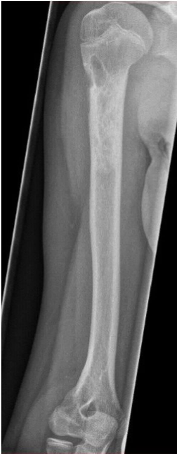
Figure 12 Incomplete filling of the cyst. 23 months after nail removal. Small residual cyst in the area of the former postoperative defect (Capanna Typ 2).

with their appearance. No patient showed any changes in their intra- or postoperative vital parameters. The most significant benefits of using the GPS ® -System are its autologous nature, the fact that it is endogenously derived and its easy availability. There are no issues of immunogenicity or transmission of infection by using the GPS ® -System or the artificial bone substitute Orthoss ® . Hass reported the successful use of demineralized human bone matrix (Grafton ® ) for the treatment of bone cysts in seven children. The disadvantages of this approach are the high costs and the, albeit low, risk of infection [42].