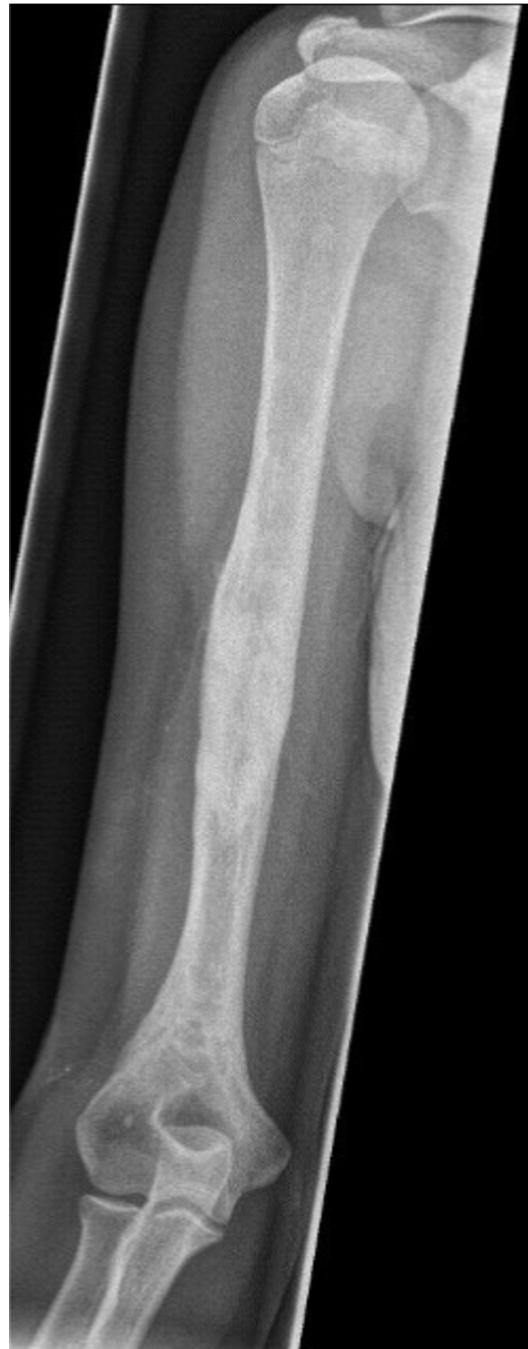
Figure 5 Complete Consolidation after a long history of failed treatment. Results 13 months after ESIN and treatment with Orthoss ® and GPS ® . Clinically the patient achieved an excellent functional result without refracture or deviation of axis.