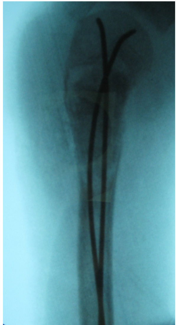
Figure 11 Incomplete filling of the cyst. Intraoperative fluoroscopic control after Orthoss® and GPS® application. Small filling defect in the upper part of the former cyst visible.

The combined biological and mechanical treatment of simple bone cysts was described for the first time by Kanellopoulos. His treatment employed demineralized bone matrix and autologous bone marrow injection in addition to intramedullary nailing for the stabilization of bone cysts. In seven patients the cysts consolidated completely; two consolidated partially [13,38]. Although autologous bone marrow collection is considered a relatively simple procedure, it can be associated with numerous complications such as biopsy site bleeding, hematoma or infection [39,40]. Harvesting enough bone marrow for huge cysts in children is sometimes problematic and causes more pain than filling the cyst and implanting the nails. To avoid these complications, we added GPS® and Orthoss® to our treatment, the rationale being that the application of growth factors from