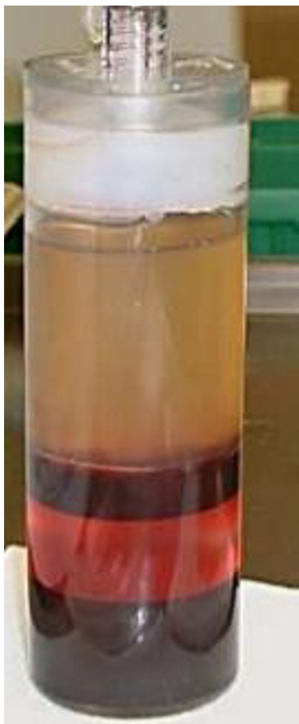
Figure 1 GPS ® -Tube after centrifugation. The GPS ® tube after centrifugation: The red blood cells fraction at the bottom of the tube is separated from the buffy coat by a buoy. The platelet-rich plasma is above and is separated from the platelet-poor plasma after the white plunger is manually pushed down.