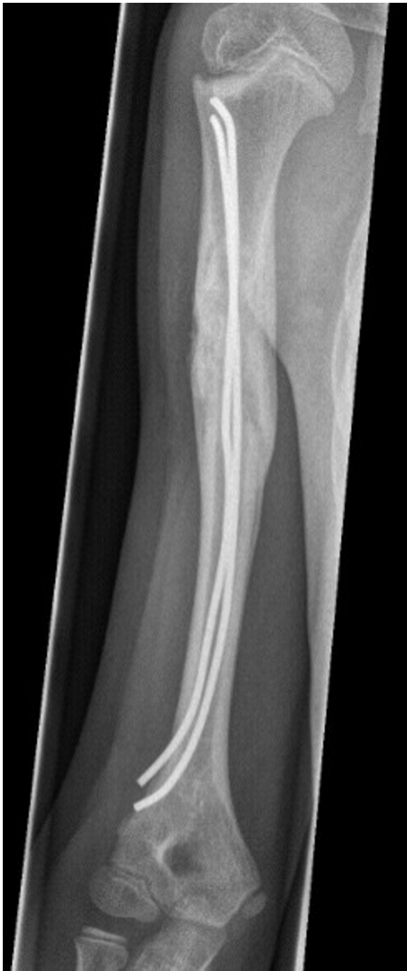
Figure 8 Patient presenting with acute pathologic fracture. Consolidation with ESIN, Orthoss ® and GPS ® . Anterior-posterior X-ray five months after treatment with ESIN, Orthoss ® and GPS ® . As a consequence, Nails could be removed.