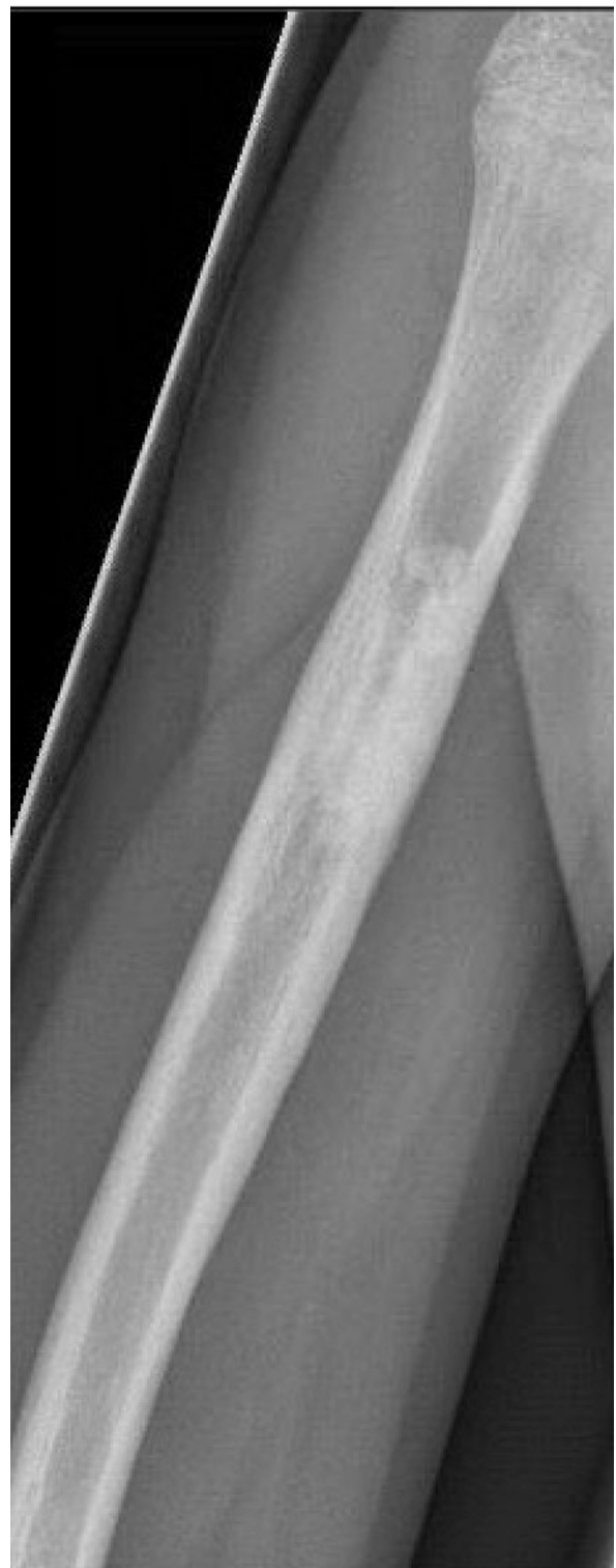
Figure 9 Patient presenting with acute pathologic fracture. Consolidation with ESIN, Orthoss ® and GPS ® . 12 months after nail removal. Capanna Typ 1.