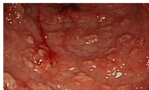
Figure 2 Transverse colon seen during endoscopy.

Histoplasmosis, caused by H. capsulatum , is generally seen in immunocompromised hosts, especially HIV/AIDS patients [1,2]. It also occurs in immunocompetent individuals and frequently presents as an asymptomatic