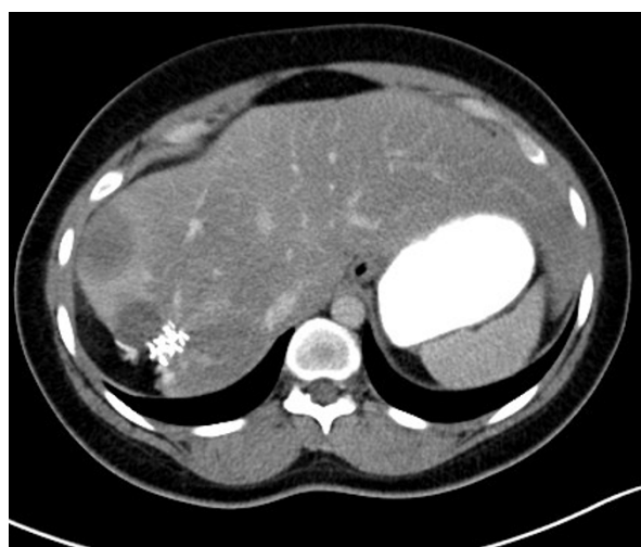
Figure 4 Repeat abdominal CT after initial hepatic resection. Several new, low-attenuation lesions are present in the right hepatic lobe. Similar, smaller lesions were present in the left hepatic lobe (not shown).

investigation for fever of unknown origin was initiated (see Table 1). Antibody titers for Bartonella quintana , and Brucella sp. were negative. An RPR was negative. Repeat HIV antibody testing was negative. A peripheral smear for malaria was negative. A transesophageal echocardiogram did not reveal any valvular vegetations. The patient refused a lumbar puncture. A percutaneous liver biopsy was performed and revealed extensive granulomatous hepatitis with occasional fibrin rings, with a background of mixed, micro- and macro-vesicular steatosis. Based on the presence of fibrin rings, the possibility of Q fever was entertained. However, ELISA testing for Coxiella burnetii antibodies was negative. Repeat special stains and cultures for AFB, fungal organisms, and cytomegalovirus were negative. Steiner silver stains for spirochetes and bacteria - including Bartonella sp. - were negative. The patient was empirically treated with a seven-day course of piperacillin and tazobactam. She remained afebrile for the remainder of her hospitalization. Based on the diagnosis of granulomatous hepatitis and the unrevealing workup for infectious organisms, the patient was started on empiric prednisone. Her liver enzymes, which had already been down-trending at the start of prednisone treatment, normalized over the next several weeks. Her symptoms resolved, and she was discharged home on a tapering dose of prednisone.