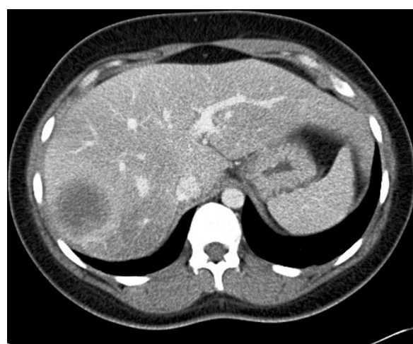
Figure 1 Abdominal CT image demonstrating a large mass lesion in the right hepatic lobe.

Two months later, the patient presented to Loyola University Medical Center with worsening right upper quadrant pain and fever. An abdominal CT scan revealed a 4.8 × 4.7 cm mass lesion involving the right hepatic lobe that was suspicious for malignancy (Figure 1). The patient underwent a partial right hepatectomy with excision of the mass. Histopathological studies of the resection specimen showed florid necrotizing granulomatous inflammation with pseudotumor formation (Figure 2, 3). Immunohistochemical stains for mycobacteria, fungal organisms, and cytomegalovirus were negative. The patient's presenting