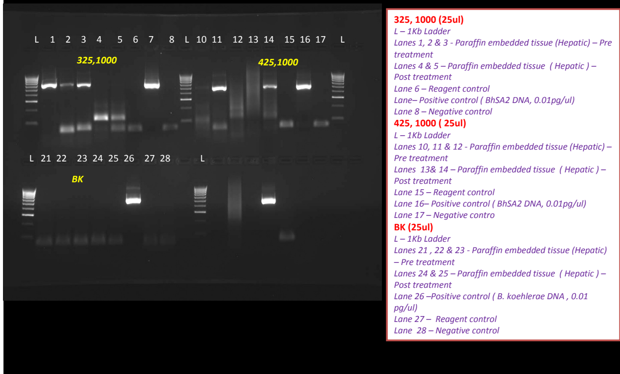
Figure 5 PCR results targeting the Bartonella 16S-23S rRNA intergenic spacer region using primers 325-1000 and primers 425-1100 (top row) and Bartonella koehlerae specific primers (bottom row). With primers 325-1000, amplicons were obtained in lanes 1-3 from the resected liver lobe (pre-antibiotic treatment) but not in Lanes 4-5 (post-treatment liver biopsy). With primers 425-1000, single amplicons were obtained in the pre- (Lane 2) and post-treatment (Lane 5) liver samples. By DNA sequencing, all amplicons corresponded to a 16S-23S strain of B. henselae . No amplicons were obtained with the B. koehlerae primer set. RC = DNA extraction control, lane, BH = B. henselae (Houston I strain), PO = PCR negative control, M = Kb DNA ladder.