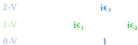
Fig. 2 The 4-complex-dimensional \mathbb{C} \otimes \mathbb{H} gives a faithful representation of Cl(2) . The pair of vectors, i\epsilon_1 and i\epsilon_2 , form the generating space (1-vectors) of the Clifford algebra, and \epsilon_3 = \epsilon_1\epsilon_2 is a bi-vector

However, readers should note that these objects behave more symmetrically than do the Pauli matrices under complex conjugation. Explicitly, (i\epsilon_j)^* = -i\epsilon_j \forall j versus \sigma_x^* = +\sigma_x , \sigma_y^* = -\sigma_y , \sigma_z^* = +\sigma_z .