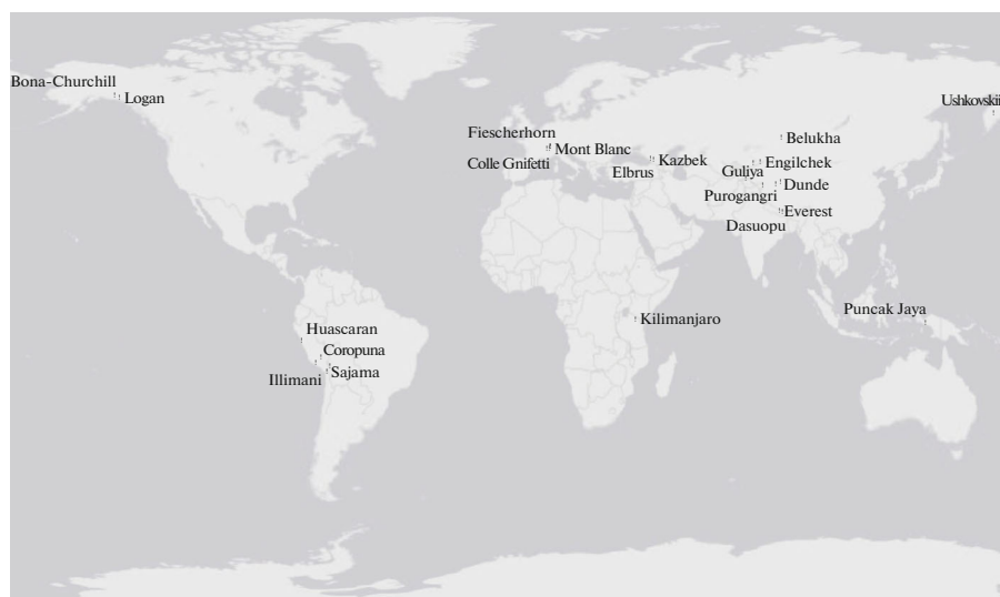
Fig. 1. Location of the main drilling points in mountainous regions (updated [8]).

of chemical components and are increasingly being used to distinguish accurately the annual core layers from Antarctica, Greenland, and the Alps [3, 4]. Methods for direct dating of ice using ^{14}\text{C} radioactive isotopes [5, 6] have received great development, while the amount of organic carbon required for analysis is only 30 \mu\text{g} , and the sample volume is 100 mL.